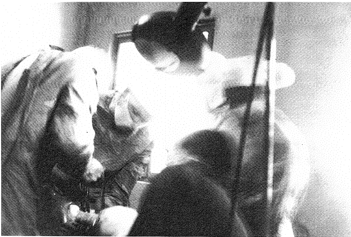
Clandestine photograph of operating room scene in the lazaret of Stalag 8B, Lamsdorf, ca. 1943, showing femur being sawn through in an upper-leg amputation.