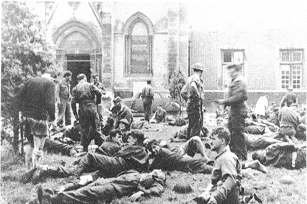
Canadian wounded await treatment following the raid.

In assessing any such claim, it must be kept in mind that much rough and ready treatment is carried out in emergency situations involving large numbers of casualties. The Germans not only had responsibility thrust on them for 600 Allied casualties, but they also had 326 of their own wounded who required care. 24 No local military medical establishment can cope instantaneously and effectively with more than 900 casualties, many very severe, that have been sustained in a few hours' fighting in a small geographical area. In cases where the wounds are (from the comfort of the historian's armchair) "minor" in nature, treatment is usually cursory in the initial stages. This triage occurs in peace as in war, and whether casualties are friend or foe. Moreover, there were apparently cultural differences in the use of anaesthesia. A British surgeon left behind at Dunkirk observed this, noting that a Belgian surgeon was inclined "to do things without or with insufficient anaesthetic. High standard anaesthetics were a British luxury not to be found on the Continent in the years between the wars." 25