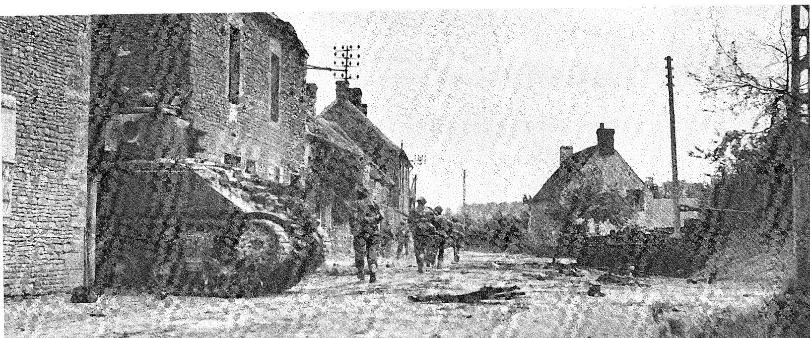
Soldiers from the Argyll and Sutherland Highlanders patrol one of the back streets in St. Lambert-sur-Dives, covered by a Sherman tank from the South Alberta Regiment. Note the knocked out German tank on the right side of the street.