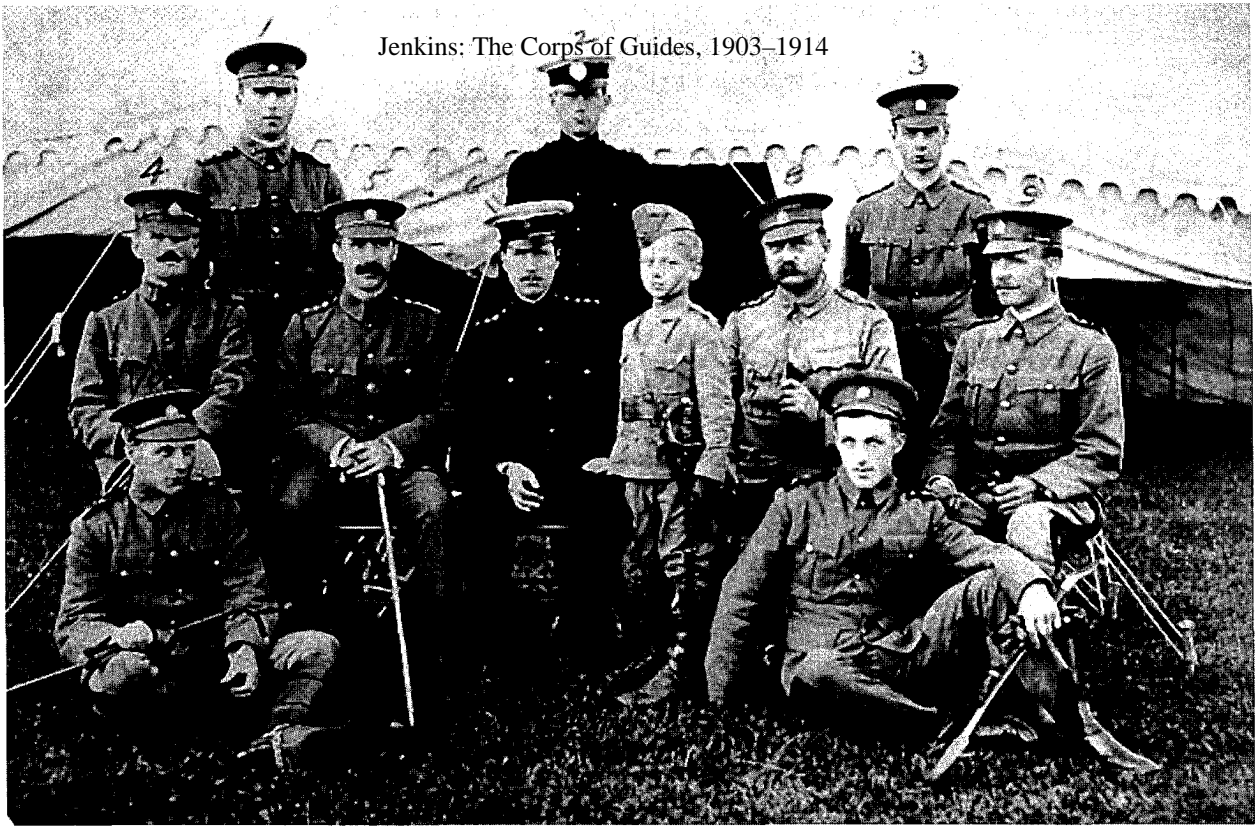
Officers of the Canadian Corps of Guides, Cobourg, Ontario, 1906.

(E.L.M. Burns Collection, NAC PA 113014)