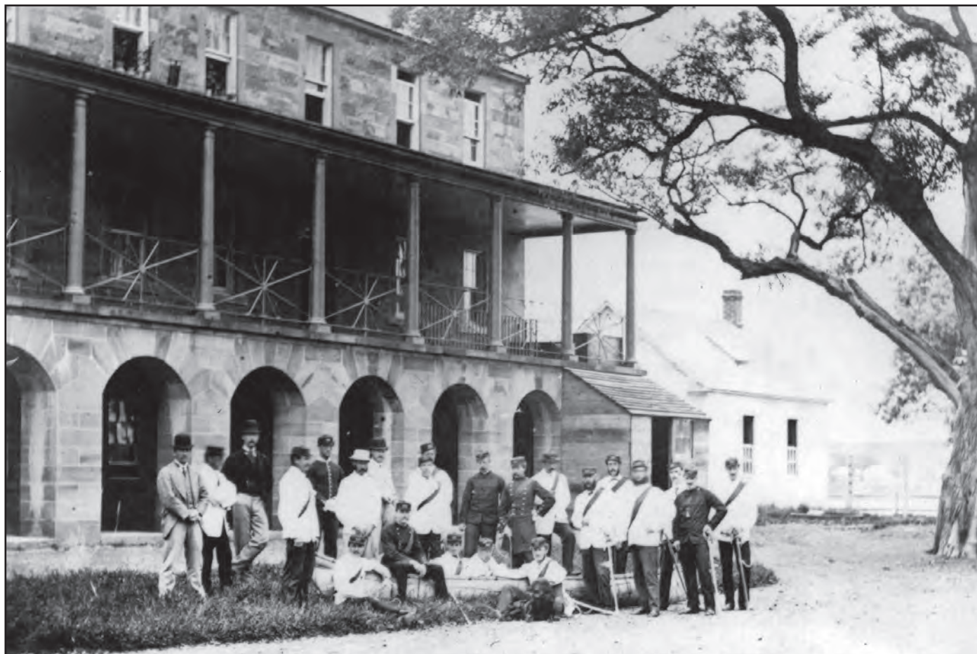
Officers of the 22nd Regiment in front of the Officers' Quarters in Fredericton, NB. The 22nd was the last British regiment to garrison the city, from 1866 to May 1869.

An episode in Saint John does seem to indicate a British bias in favour of Orangemen. On 6 March 1849, after restoring order in the streets, regulars escorted a large number of besieged Orangemen home by surrounding them with a "protection guard." 76 Some historians suggest that efforts to control riots in Saint John in the late 1840s may have created a "fusion" between all levels of authority, including British troops and the Orange Order. 77 This may be overstating the case; the lieutenant-governor's account of the York Point riot indicates that the mayor used troops against both sides, once against the Catholics and twice against the Orangemen. 78 Moreover, soldiers did not have a free hand; they acted under the direction of civil authorities, who may indeed have had a vested interest in the outcome. An officer in the midst of a riot would have disobeyed a magistrate at his peril. Nevertheless, although a more concrete assessment must await further study, evidence does suggest that British troops did not always act impartially.