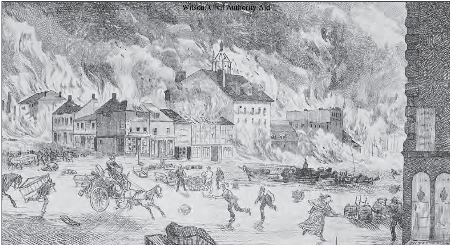
In late June 1877, fire devastated much of the city of Saint John. Local militia were called out to control crowds during the fire, and protect property and patrol the streets afterwards. Canadian Illustrated News , Vol. XVI, No. 1, Pages 8-9.

Confederation, they generally operated in concert with the police. In the Fredericton Branch Railway strike of June 1869, the regulars accompanied the deputy sheriff and two policemen. 29 During the 1875 Caraquet disorder, a detachment of the 73rd Northumberland Battalion protected constables while they arrested protestors and guarded prisoners and, in place of constables, mounted sentries at several establishments. 30 During the Saint John conflagration in 1877, militiamen kept back crowds while firemen extinguished the flames and afterwards placed guards on bank vaults and public buildings throughout the unburned portions of the city. The troops separated into several parties, each under an officer, and patrolled the streets at night with special constables. 31