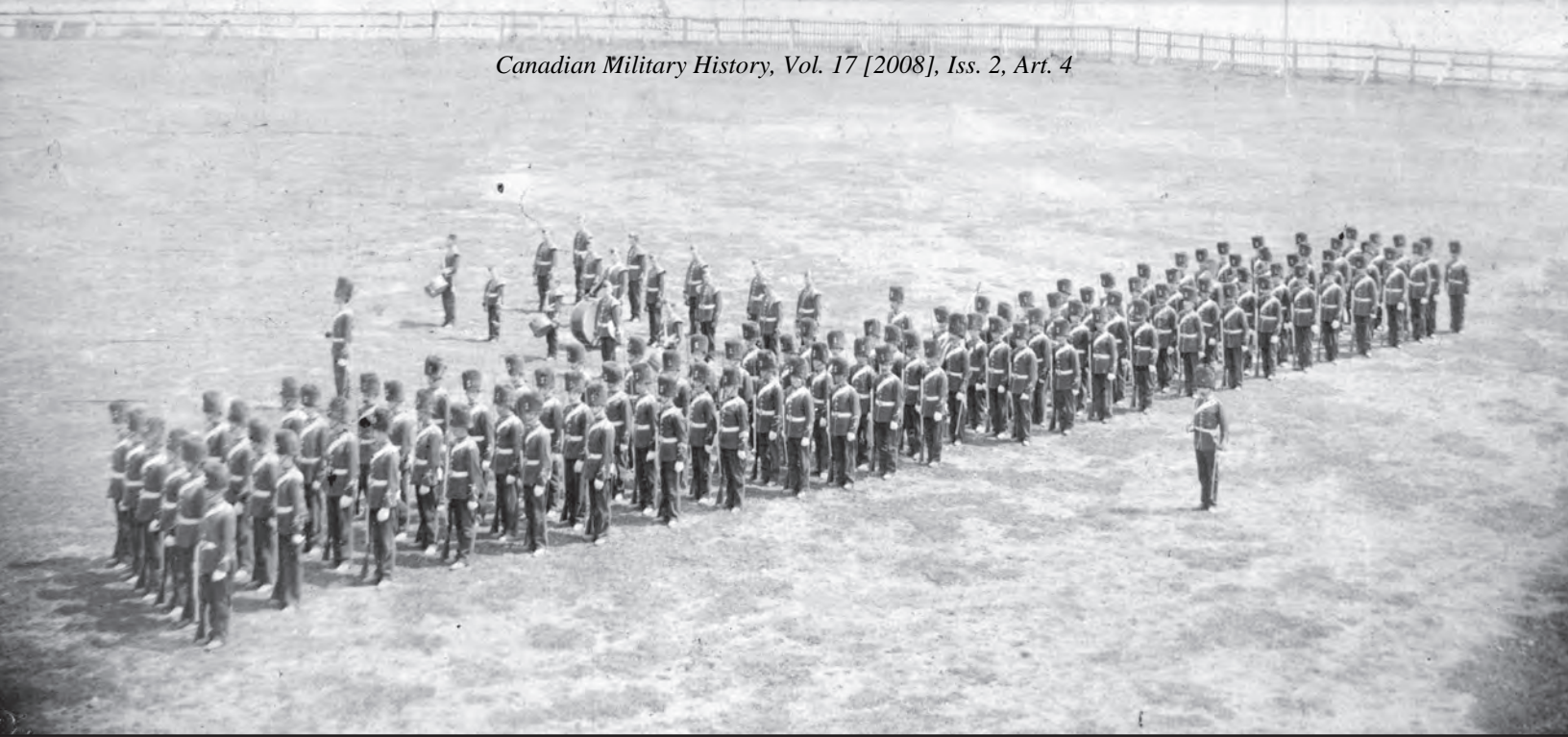
Soldiers from the 62nd Battalion, St. John Fusiliers, ca 1880. They were called out to aid the civil authority during a dock workers' strike in May 1875, the Orange procession in July 1876, and the Saint John fire in 1877.

1869 railway strike in Fredericton the arrival of the detachment of the 60th Rifles had an almost instantaneous effect. According to the New Brunswick Reporter , "On seeing the 'Dark Green Jackets' a regular skedaddle took place, equalled only by the celebrated 'Bulls [sic] Run.'" 81