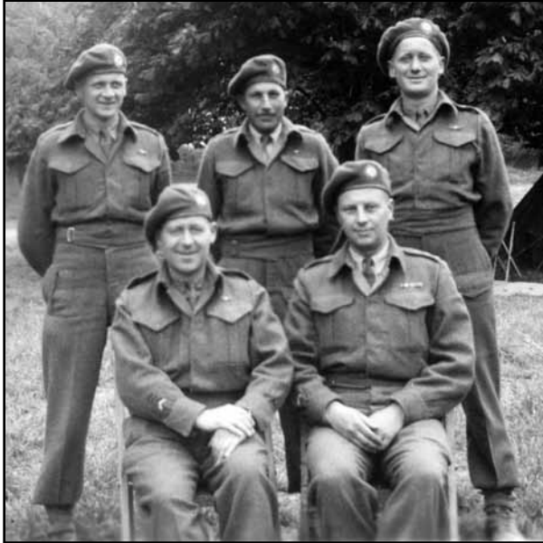
Officers from the South Saskatchewan Regiment photographed in May or June 1944 at Broome Park, England (north of Dover) just prior to the invasion.