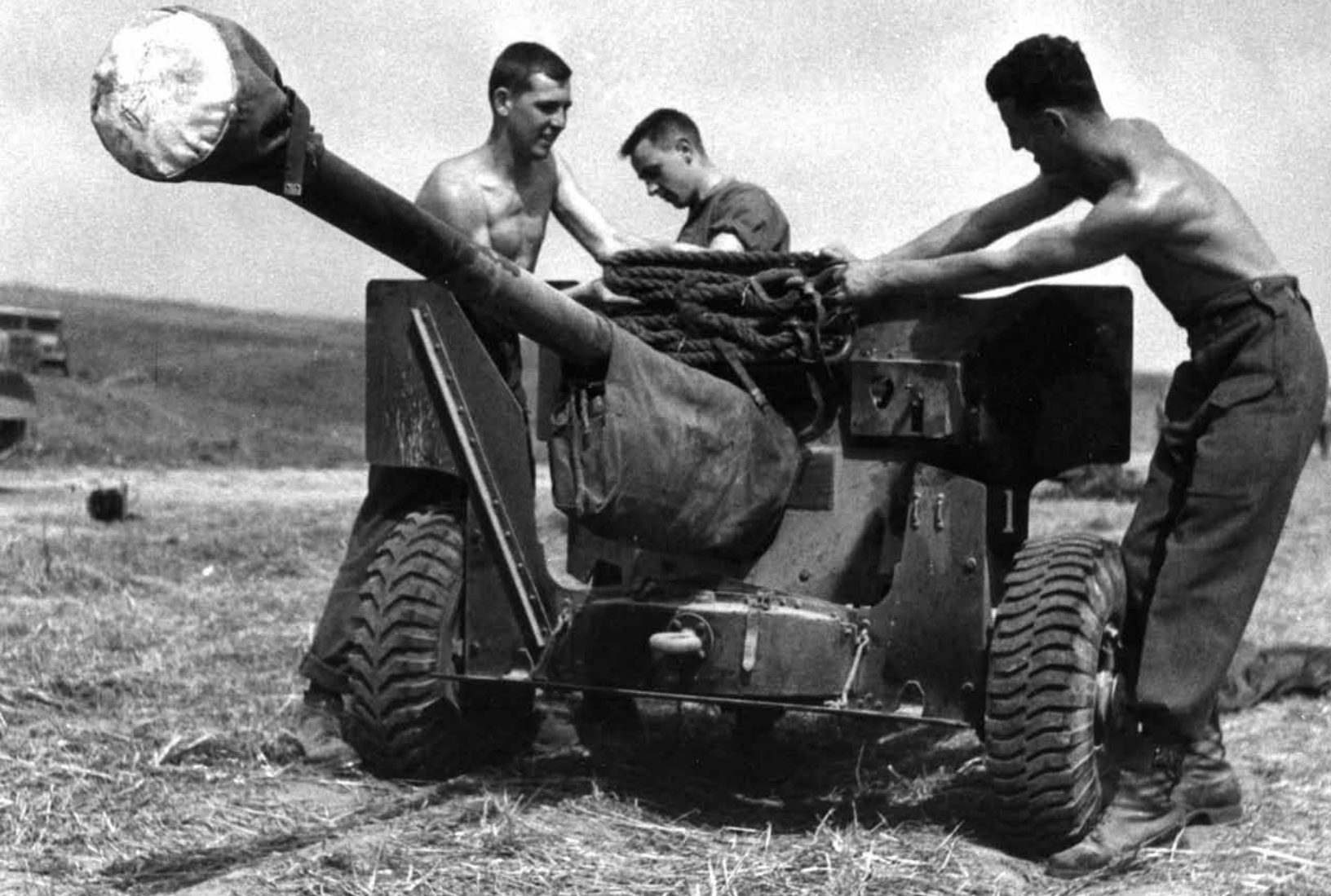
Canadian soldiers ready a 6-pounder anti-tank gun for action.

remnants of Company HQ and 12 Platoon. The other two platoons also crawled back through the wet wheat. Yet many more men were cut down during the withdrawal.