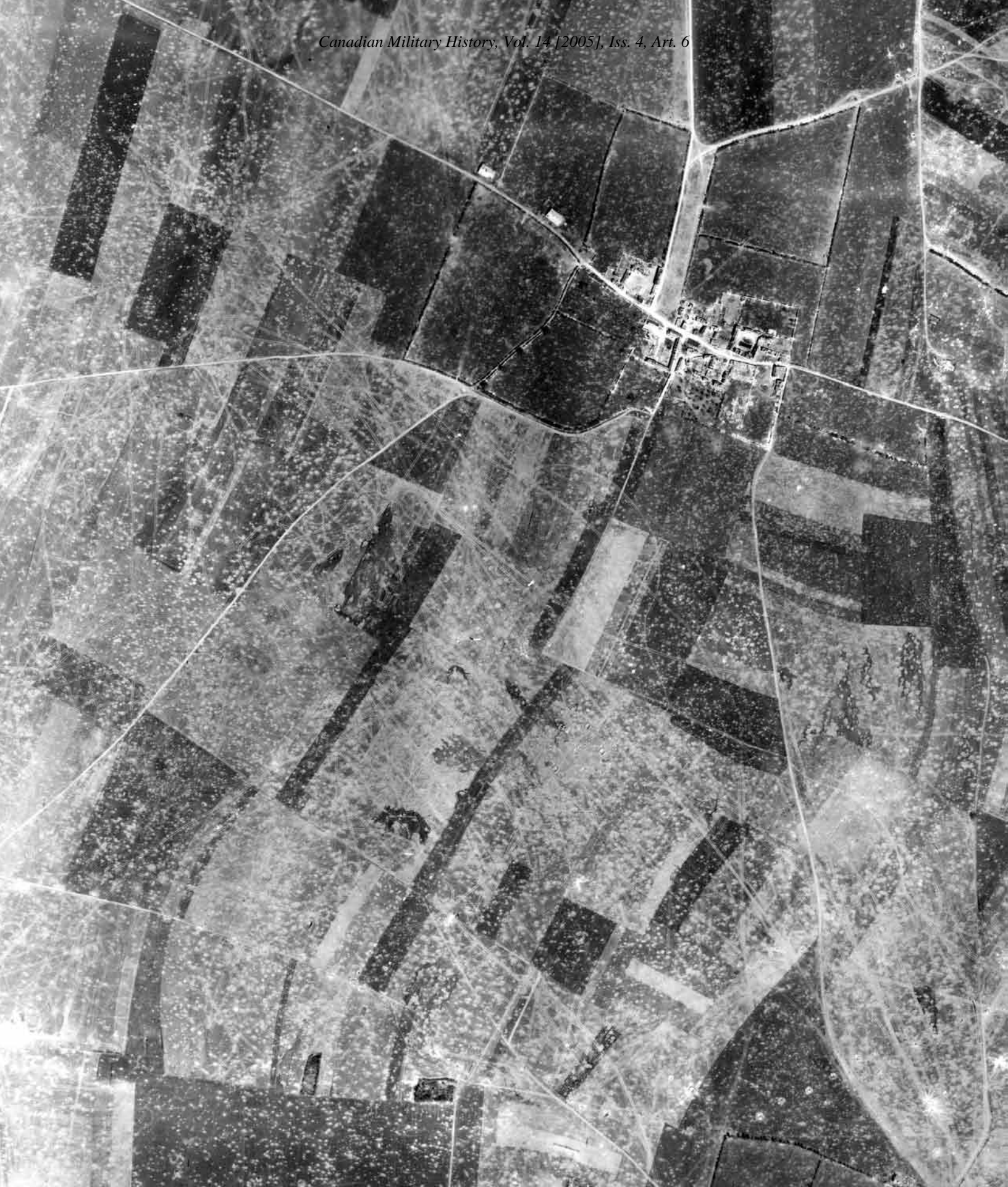
56 This air photo shows Verrières Ridge to the southwest of Verrières village. This is the area of "Poplar" - the objective of the South Saskatchewan Regiment during Operation "Atlantic," and is also the location where the German armoured counterattack hit the Canadians. The openness of the terrain is evident from this image as is the scarring of the battlefield due to shelling and the tracks of armoured vehicles.

http://scholars.wlu.ca/olj/vol14/iss4/no56