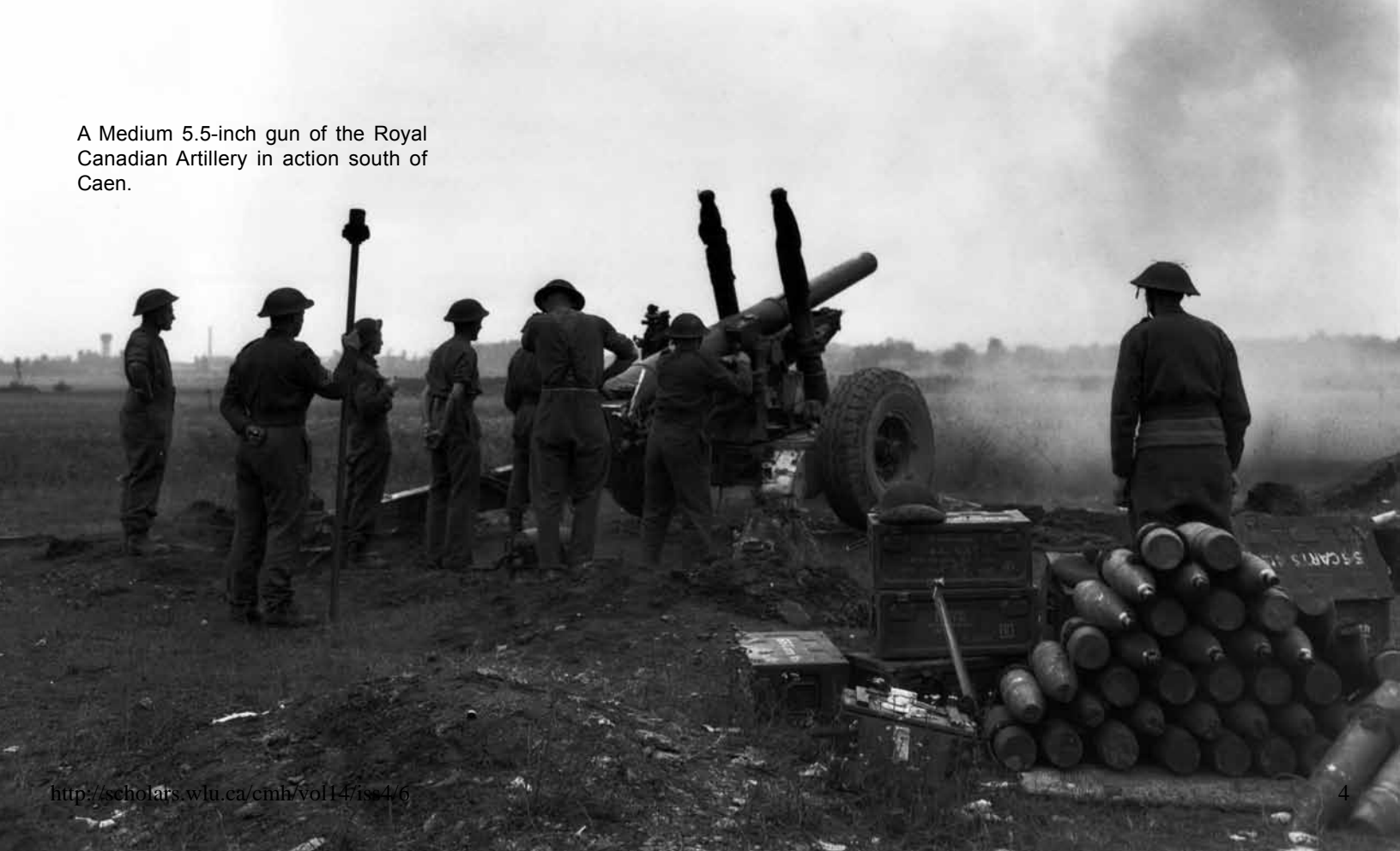
A Medium 5.5-inch gun of the Royal Canadian Artillery in action south of Caen.

The balance of the tanks or "B" Squadron were held in reserve in a position of observation at MR 023634 west of Ifs until ordered 200 yards to the right behind "A" Squadron at 1800