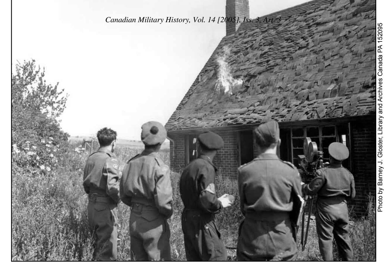
The Smoke of Battle film in the making. A film crew looks on as a house is set on fire, Sussex, England, 8 August 1944.

the beginning of the difficulties between the CAFU and the NFB, and it set the stage for the "war of wills" that was to play out over the coming years.