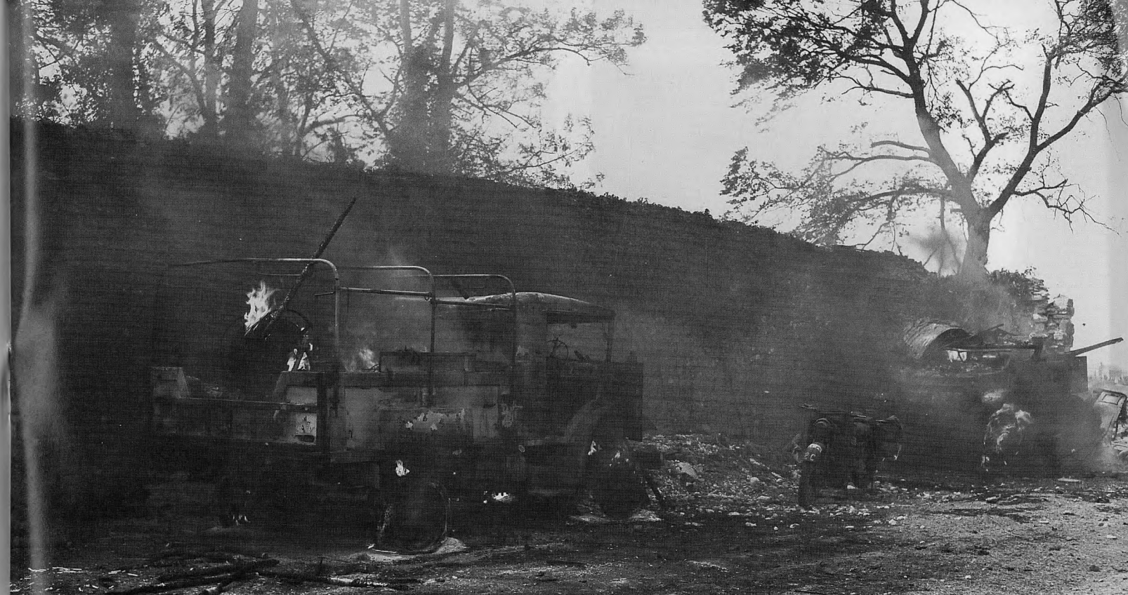
Canadian vehicles burning near Cormelles after the accidental attack by American bombers, 8 August 1944.

On 8 August the North Shores left the rest area to return to the front. They travelled back over the same ground along which they had earlier advanced east of Caen, prompting MacDonald to reflect: "This is beautiful country. It's a crying shame to lay waste these homes and gardens and roads and churches. Got a few Huns and have had a hectic few days." The unit formed part of a column travelling southwest. At Cormelles, just south of Caen and about four kilometres north of Bourguébus, an appalling event occurred. The North Shores lost 37 killed and 78 wounded when they were accidentally bombed by aircraft of the United States Army Air Force. 2 He had his carriers parked on a hillside road, near Cormelles, because an "O" or Operations Group had been called at Division, and they had to wait for a signal from their colonel to move again. In the valley below them, some heavy guns were pounding away. As they sat there, a big flight of U.S. B-17 bombers came