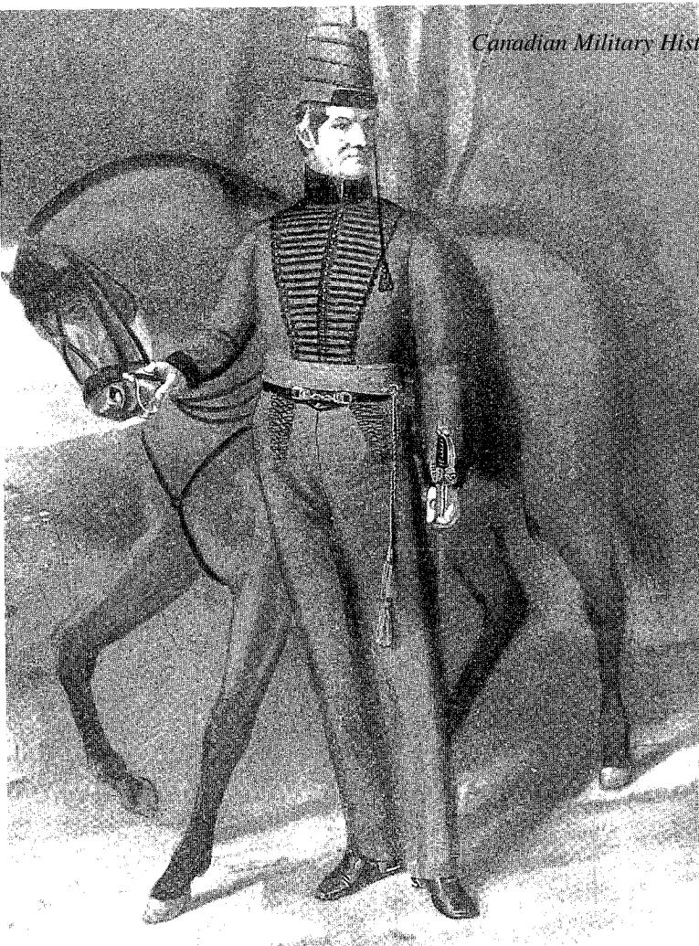
National Archives of Canada, C25697