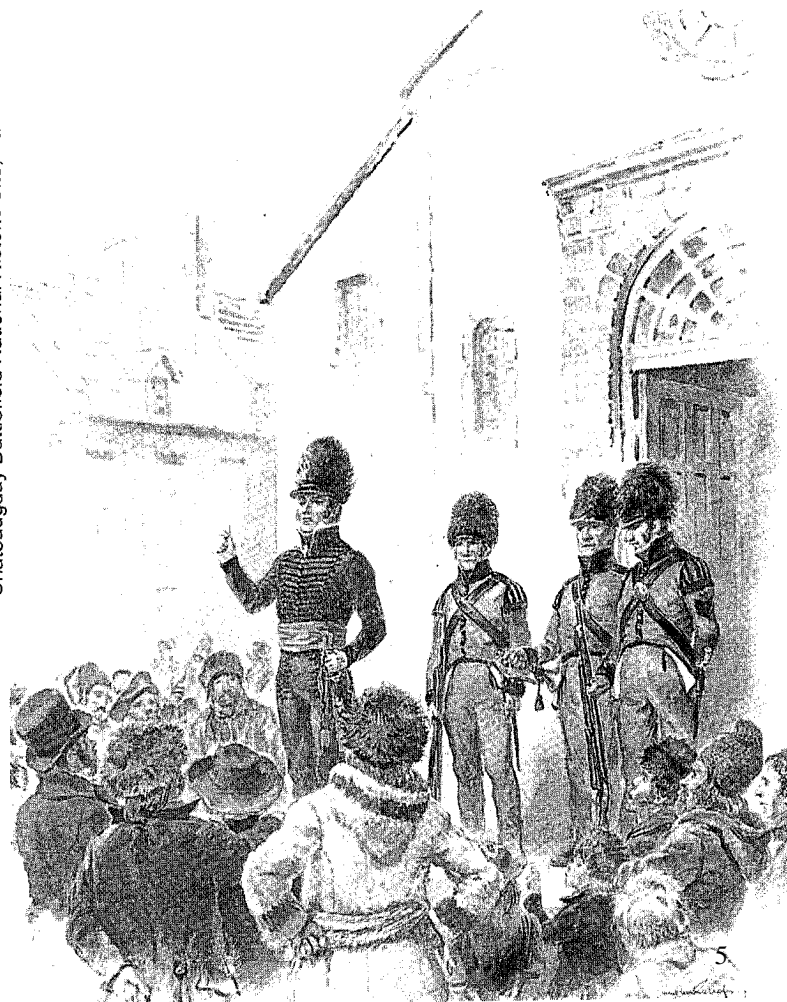
Chateauguay Battlefield National Historic Site