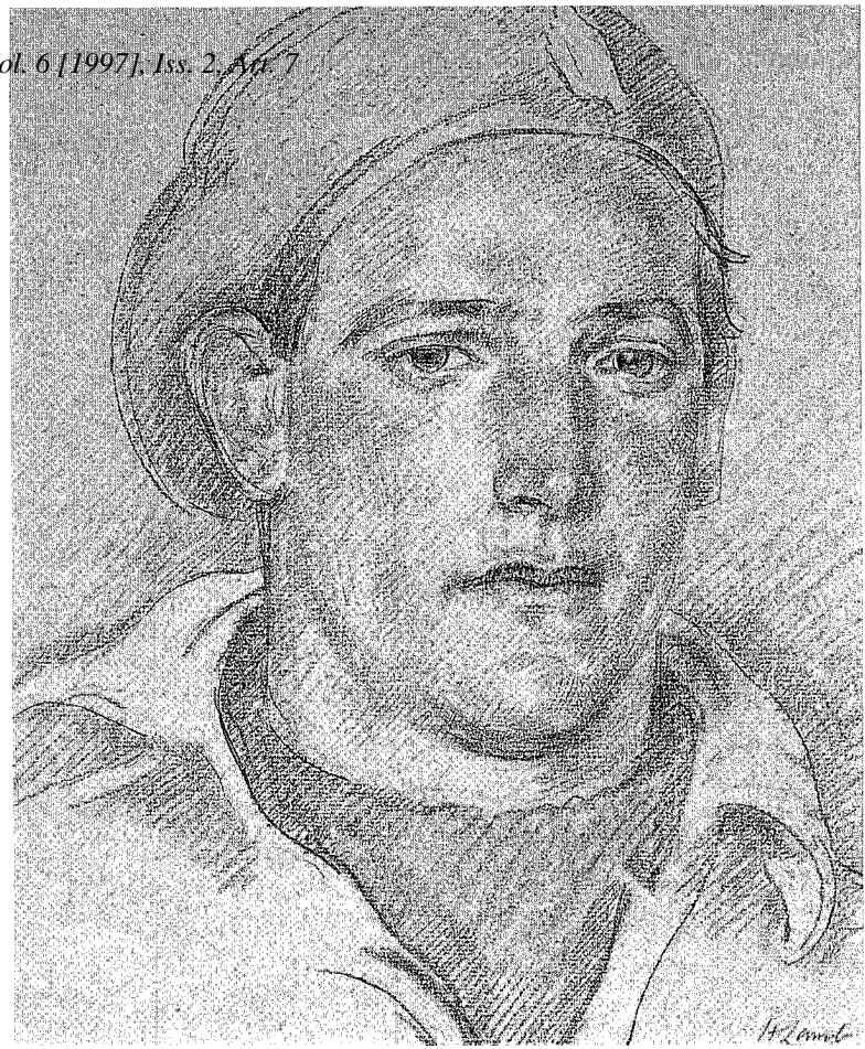
(CWM CN 7821)