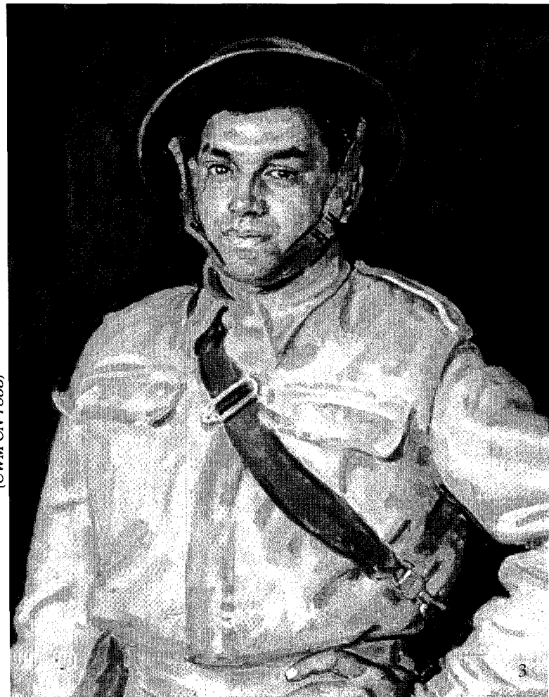
Figure 4: "A Redskin in the Canadian Royal Artillery"