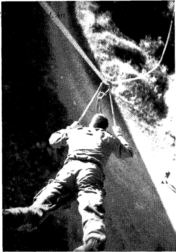
The author undergoing training at Castelnaudary. At left he climbs the "eavesdrop" in an exercise designed to simulate the infiltration of a building or fort. At right he takes leaps from the "paratower" during his jump training.

most sought after by everybody. To be respected by other candidates, and the Corporals in charge of us, made life so much easier. Two months into instruction the physical strain took effect. Some were released for physical damage, others for mental damage. To watch a man slowly change and finally break was something of which I took special note. Suicides are common at Castelnaudary and if you fail you get 30 days in jail. Graduation could not come too soon and for many of us, the training would continue at the Regiment.