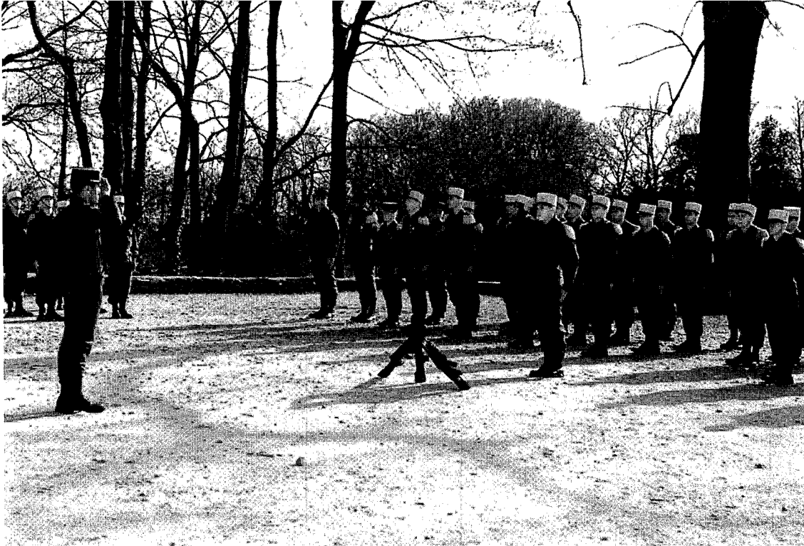
The author presents his section.

sat exposed there for the launch. It was a very tense hour or two for many people.