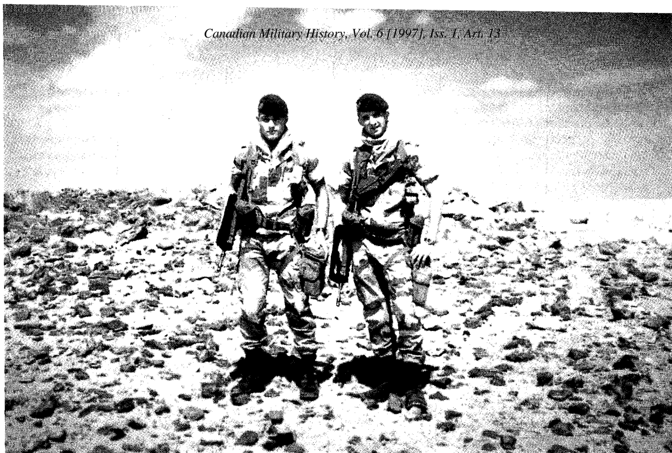
Above: Three hours from Bagdad. Right: Al-Salamin airport

Speaking French at night check-points in the 82nd Airborne zone was a big risk – apparently they found French and Arabic quite similar.) Everyone seemed anxious to fire their artillery, rockets, and missiles at the Iraqis. One night on the Saudi-Iraqi border, about 13 kilometres from an Iraqi outpost, we had just gone to sleep in a reconnaissance bivouac, with nobody between the Iraqis and us except our forward observation post (FOP) fifty metres in front. At about 0300 hours, a convoy of French trucks and artillery encountered our FOP and exchanged the right codes and continued to pass between our FOP and our bivouac. The legionnaire at the FOP had no idea what they were doing but correctly followed the set procedure and let them pass. At around 0330 hours, I awoke from my sleep in a panic as the ground shook and my ears rang – I ran for my hole outside my tent thinking we were being shelled. To my surprise, just 20 metres from my tent was a battery of French 105 mm guns blasting away at the Iraqi outpost. After a heated yelling match with the artillery officer, they very quickly packed up and disappeared. We also had to leave quickly because of the danger of a