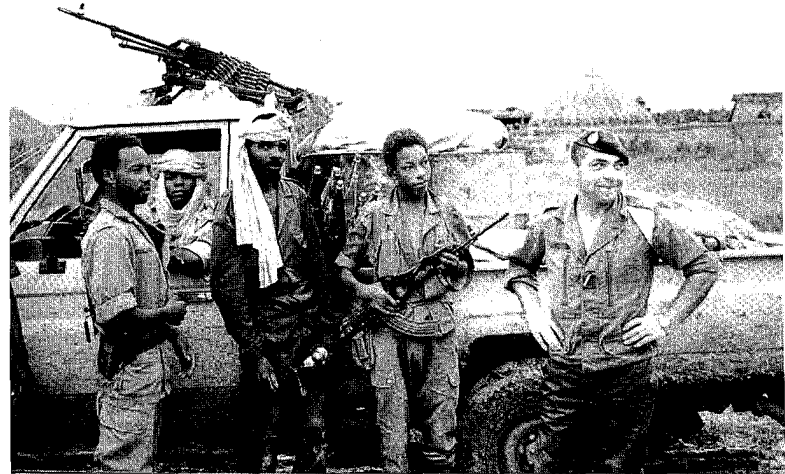
Scenes from Chad.

I dreamed of returning home and being amongst friends and family. The memories of people, places, and situations so recently experienced were etched into my brain forever. There were many times when I regretted ever joining, but there were also times I wouldn't want to have missed. I chose to come home because of one main factor – at 23 years of age I believed I could chalk the five years up to experience and build upon it. If I stayed, I ran the risk of closing in on eight years of service, when the pension at 15 years becomes enticing, and I would consider staying in until I was over 30. The pension option compared to other pensions sounded good, but during my five-year contract I never met a Legionnaire who was able to leave the Legion cleanly (no permanent mental or physical damage) after 15 years. I walked out past the