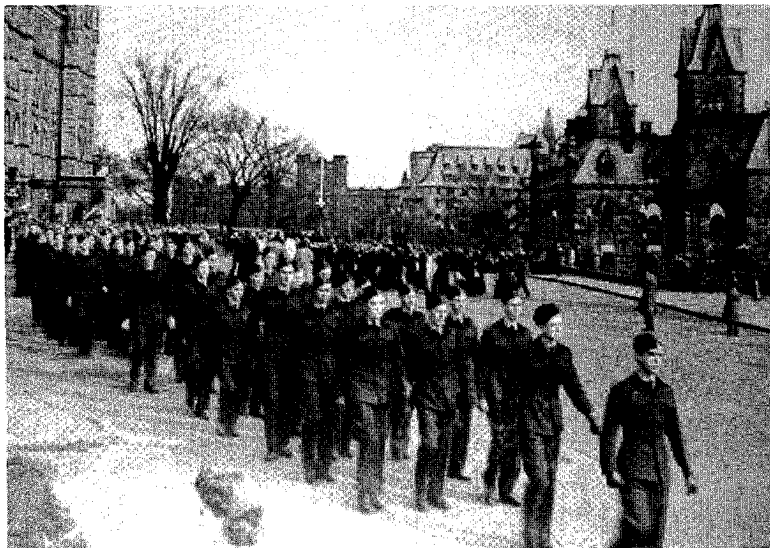
Above: Members of Lisgar Collegiate's 94th Cadet Corps parade on Parliament Hill.