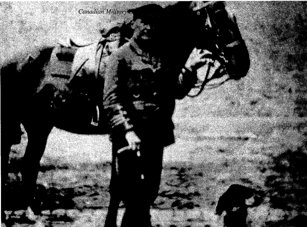
Lieutenant-Colonel John McCrae with his horse Bonfire and his dog Bonneau, c.1916.

strategy had advanced significantly over the previous 15 years.