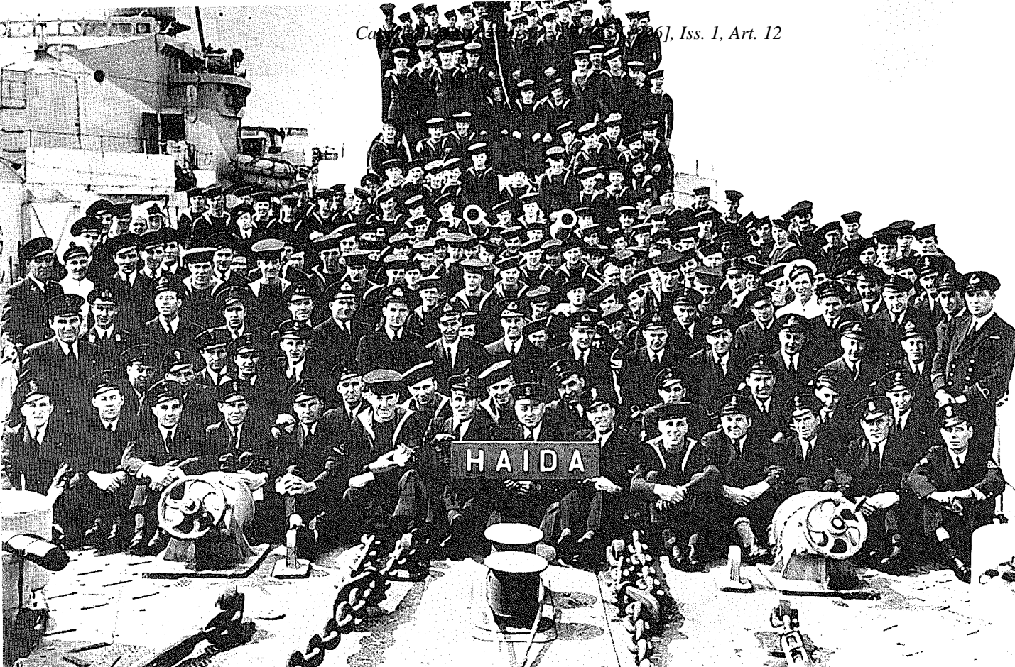
Above: HMCS Haida was the third Canadian ship commissioned into the Tribal Class of Destroyers after HMCS Iroquois and HMCS Athabaskan. Commander Harry DeWolf (centre, holding name plaque) was Haida's first commanding officer. Although she joined halfway through the war, Haida went on to become Canada's most famous wartime ship having sunk 11 enemy vessels, including four destroyers and a U-boat. She began her career escorting convoys into the Arctic on their supply runs to Murmansk, USSR. She was part of the escort group that found the German battleship Scharnhorst which was sunk by HMS Duke of York in December 1943. As part of the 10th Destroyer Flotilla, she was a member of the fleet that invaded Normandy.