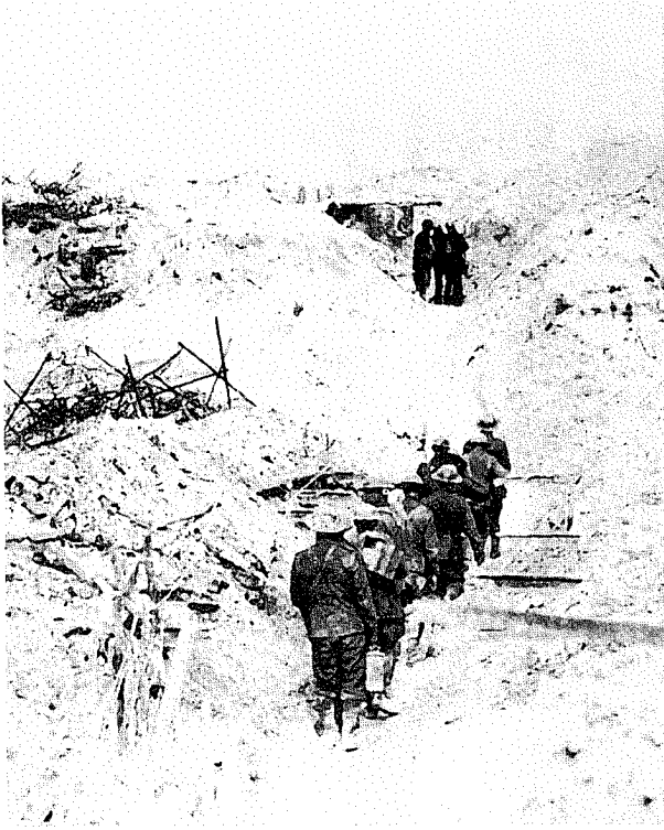
Canadian troops advance along a trench on the outskirts of Lens.

one remembers that unlike the other diversions (and in fact the main initiatives) the Canadian operations were stunning successes and significant defeats for the German Army. At any rate a series of limited objective operations were conducted by the British First Army in the spring and summer of 1917. The attack on Hill 70 was one of these actions.