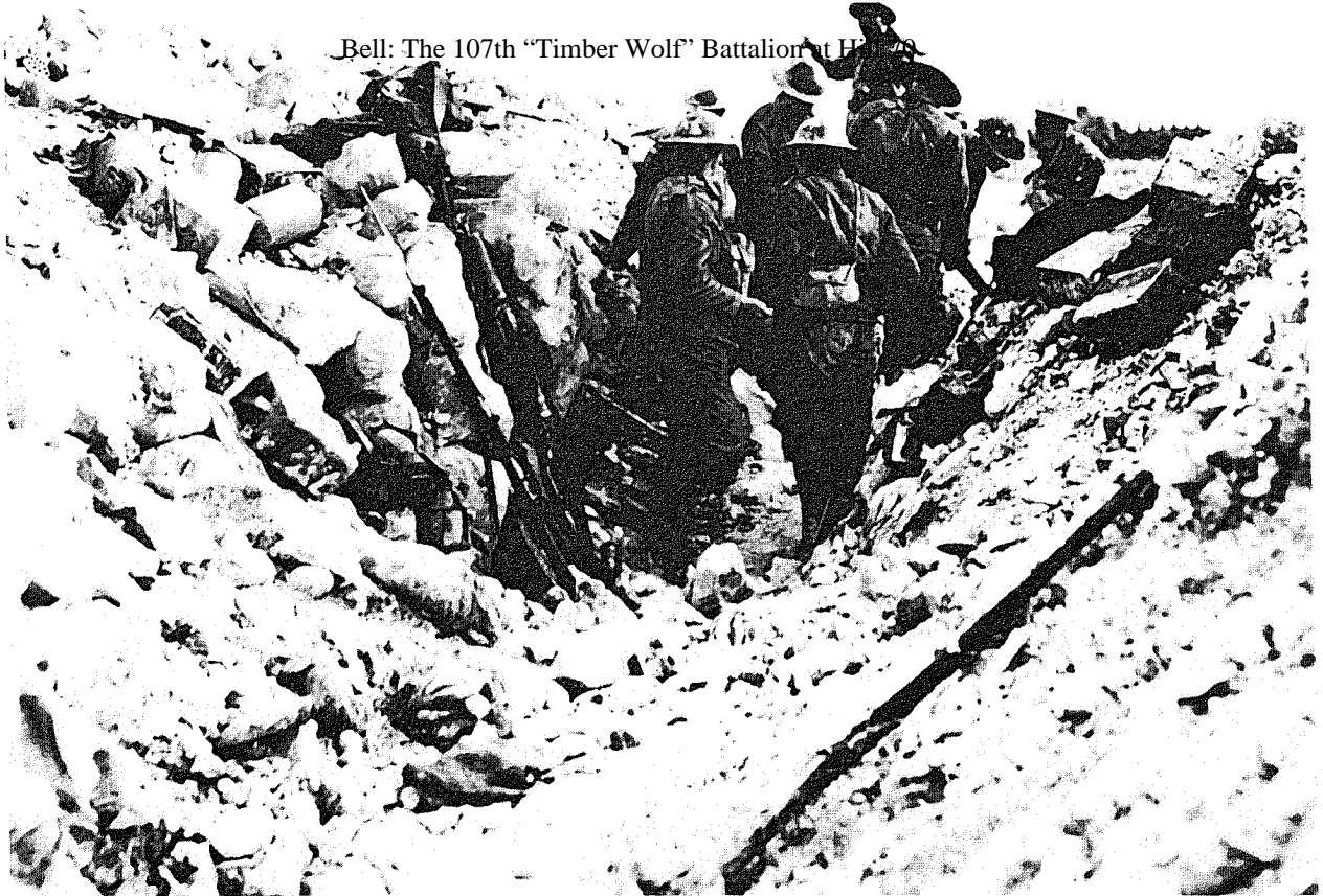
Canadian soldiers rest in the German trenches on Hill 70 following the battle.