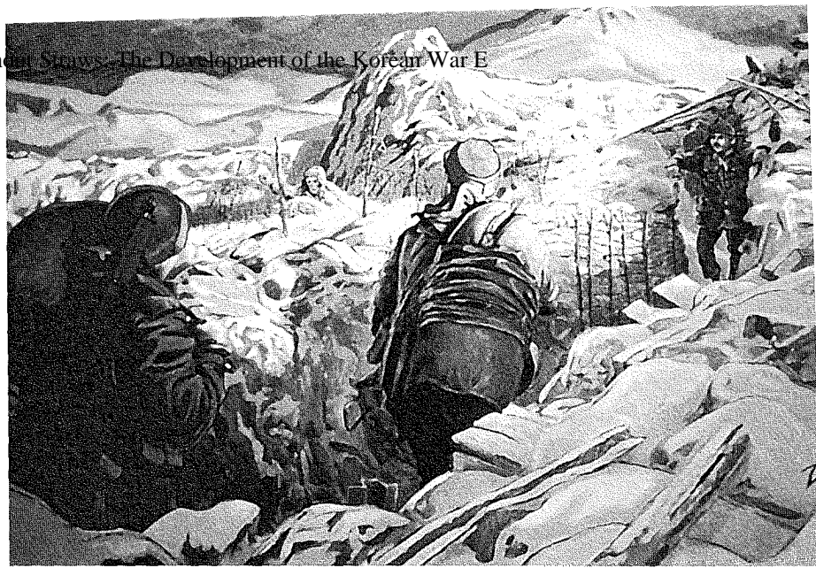
Welcome Party by E.F. Zuber (CWM CN 90026)

It is from the artifact standpoint, however, that the project draws the most criticism. While the planning, design, construction, etc. match or exceed that already in place throughout the museum, the actual content falls short of initial expectations. Nothing can replace real artifacts and the fact that a mere three items on display were actually in Korea leaves the Museum, in one sense, shortchanging the visitor. The lesson to be learned from this experience is simple, though not always achievable. Exhibits cannot rely solely on secondary/supporting material and must include genuine artifacts if they are to bear the hallmark of authenticity.