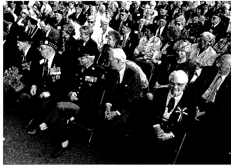
Dignitaries at the unveiling of the Monument.