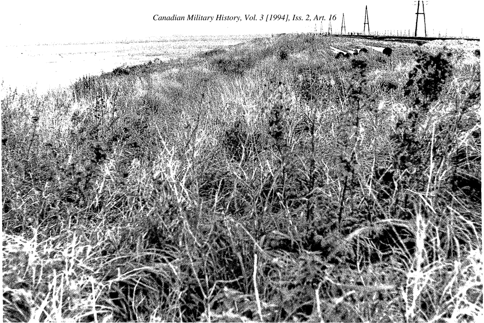
The German view down the Walcheren causeway towards Beveland. Photo taken in 1946.