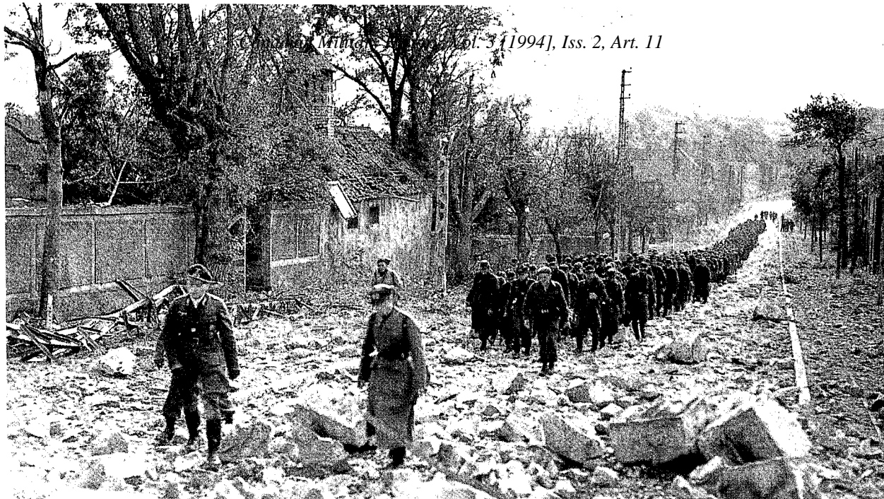
A column of over 400 German prisoners pass through the damaged streets of Boulogne, 21 Sept 44.