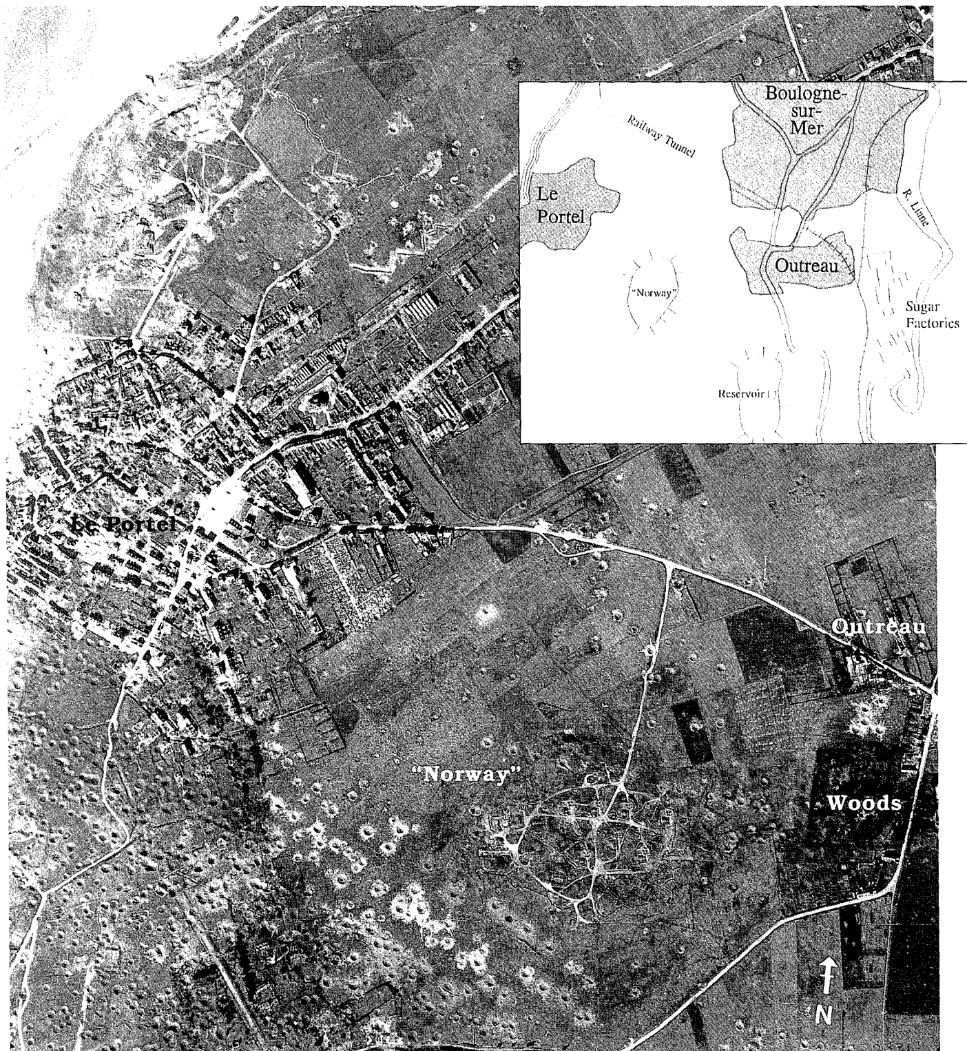
The German strongpoint "Norway" which contained six 88s and nine smaller calibre weapons is clearly visible at the bottom of the air photo. To the right, at the edge of the photo is the woods where the SDGs formed up for the attack.

Insert: Sketch map showing the SDGs Phase III objectives.