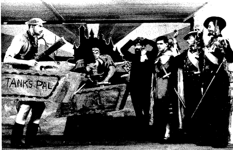
A concert given by the prisoners of war at Stalag Luft 1, 1941.

We had twelve cats in the camp and they all disappeared into the cooking pot. Hungry as I was, that particular stew had no appeal to me and I couldn't touch it.