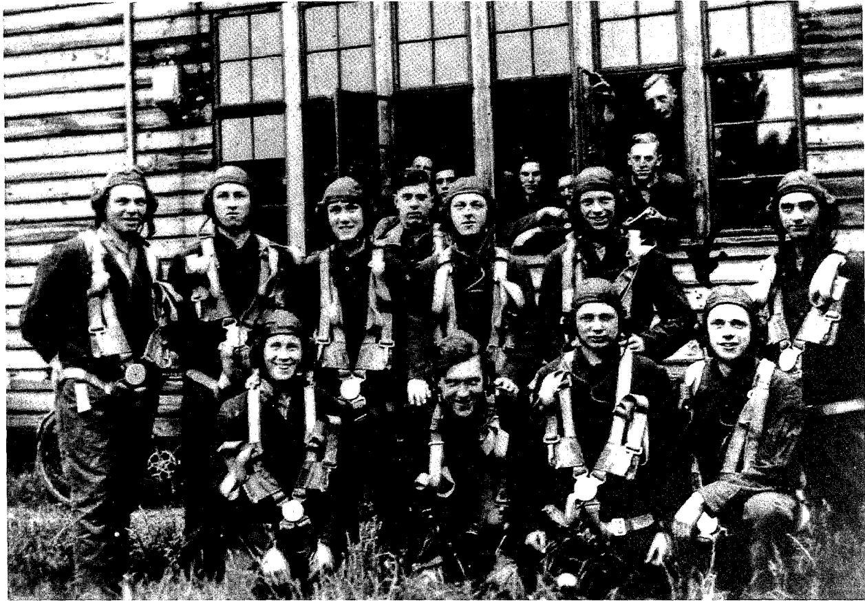
Class of 7B9—Initial flying training, 1937. Only two airmen of this group survived the war. The airman kneeling on the left and the author kneeling on the right.

A German police officer arrived and demanded in broken English details of my aircraft and crew. I refused to answer. He then hit me across both sides of the head and with his pistol pressed against my stomach made further threats. Not getting any answer, he pushed me into a chair and said, "What does it matter. We shoot you in the morning anyway."