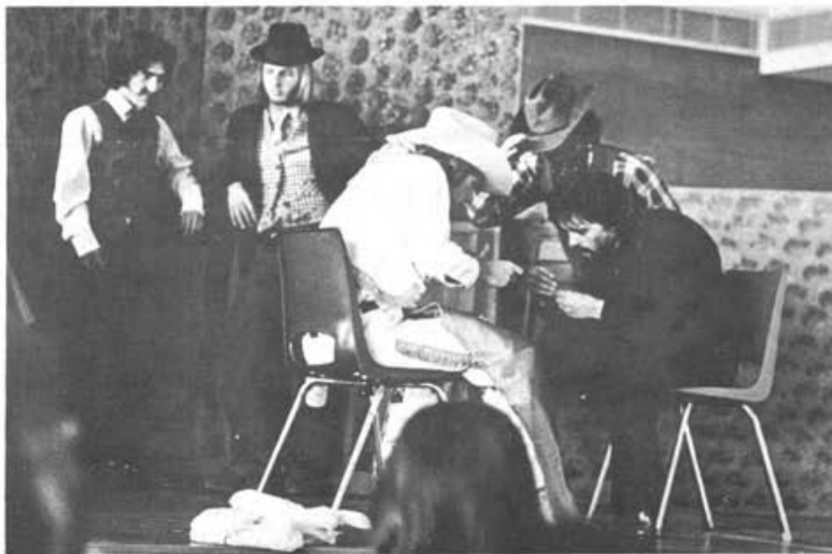
Player's Guild cuts the deck to a full house in Dude.

Based on the three plays the Guild has presented, I say go! See this play, it will be worth the dollar admission, you'll enjoy it, the Guild deserves your support.