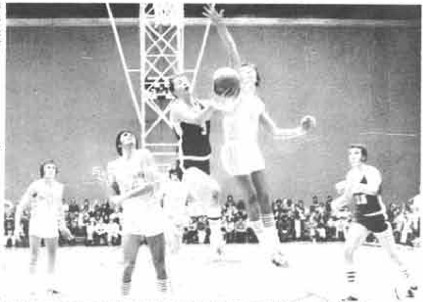
What can you say about a team that had everything...and lost?

This game marked the end of the regular season play. The Lutheran girls, it seems, started off with a whimper and ended with a roar.