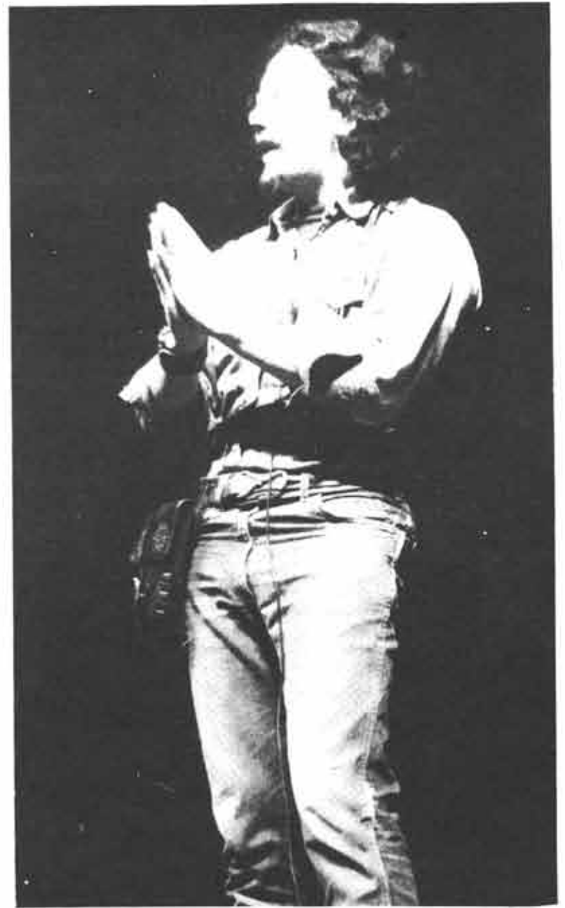
Dr. David Suzuki

But it is time, concluded Dr Suzuki, for everyone to get out of the rut of blindly accepting authority—time for educators, politicians, and scientists to stop holding out on the public they are supposed to be serving, and more important, time for all the supposedly "inferior" players in the power games to demand a say in their own lives and in the future we will all have to share.