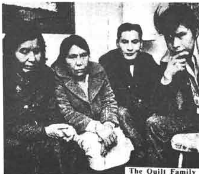
The Quilt Family

Their verdict was that the police cannot commit a crime. They decided that a white story is more correct than an Indian story. They also decided that the oppression of Indian people in Canada would continue.