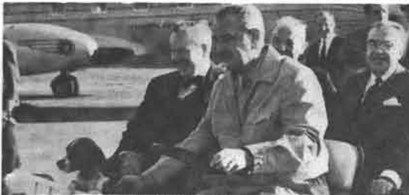
A man who was forced to take a back seat.

The following year, King again shuffled his cabinet with the result that Martin was removed from the Secretary of State portfolio and placed in charge of National Health and Welfare.