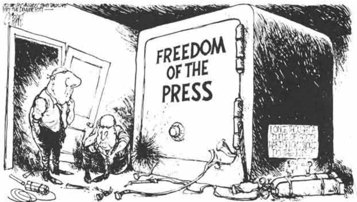
"If only we could haul it away someplace and work on it quietly. . ."

The new system definitely discriminates against the student with high marks; whether a student has an 80 or 89 he still gets 11 GPA; whether he has 75 or 79 he still gets 10 GPA. It's going to be pretty difficult to maintain an A average at W.L.U.