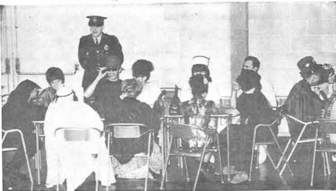
Be Glad There Is A Year To Recover