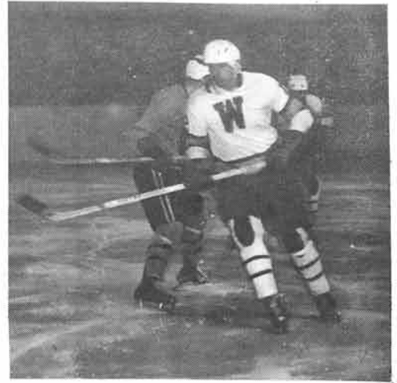
Saturday at 2.15 the Golden Hawks played to a 3-3 tie with the U of W in a televised game at the K-W Auditorium. Sticks were high at times and sometimes the puck got lost and no one knew where it was.

One wonders about the Toronto games, as good facilities and good referees have been few and far between, there is room for improvement!