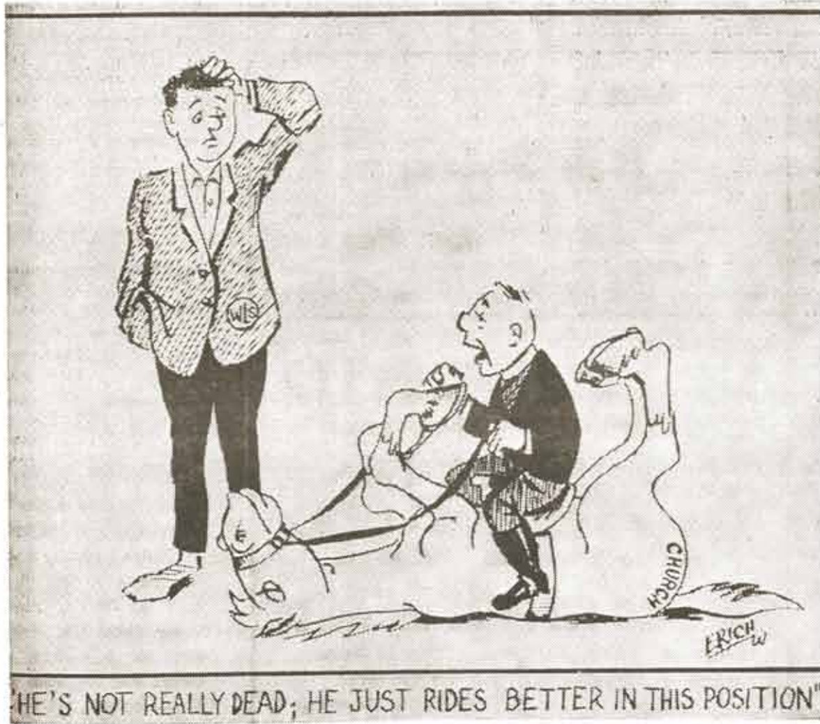
HE'S NOT REALLY DEAD; HE JUST RIDES BETTER IN THIS POSITION"

In addition to playing sax with various dance bands and (Continued on Page 6)