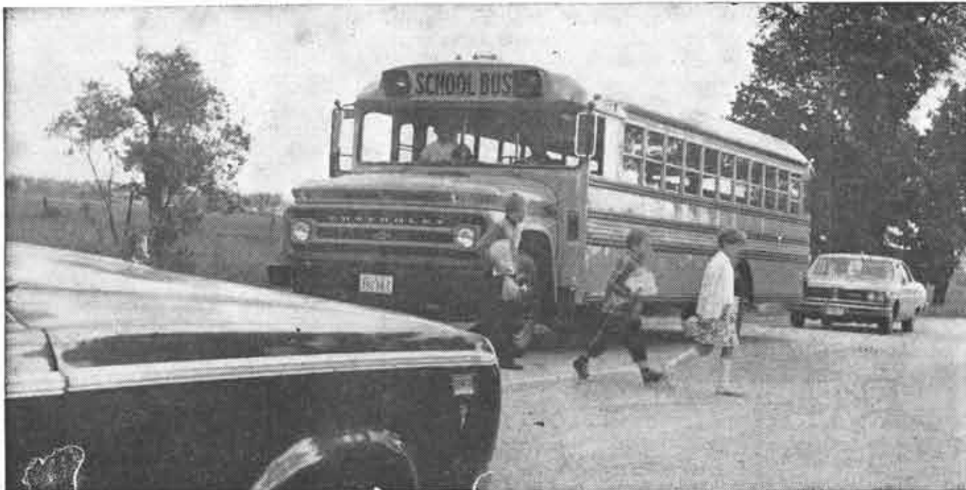
TRAFFIC MUST STOP IN BOTH DIRECTIONS NOW!

The circular questioned the CUS national executive's right to make policy statements on world issues while at the same time claiming to represent the opinion of all Canadian students. It urged delegations to the 30th Congress to consider restricting