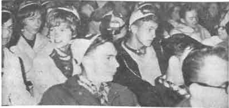
THE FRESHMAN CLASS of 1966 waited patiently for all campus events to appear on this page. Last Monday night, initiation week started off with an organization meeting and dance.