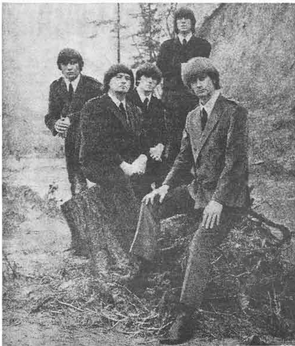
The Stich in Tyme will be featured at the decaping dance on Saturday

Next weekend, all college leagues will be engaged in regular season play.