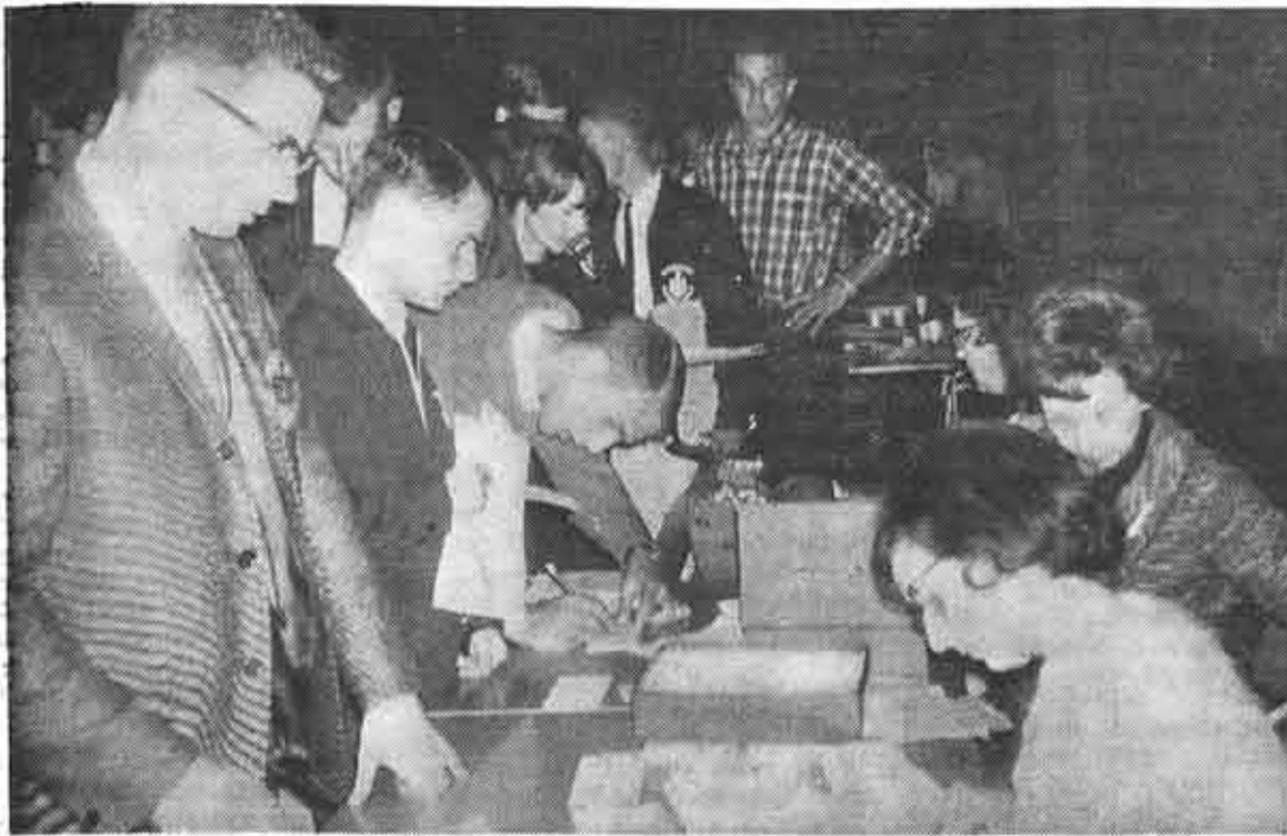
TIRED BUT concerned faces watch as yet another young innocent signs away his summer's savings in what a former Cord editor claims is the worst regis-

tration ever. (See Letters to the Editor). The fellow in the background seems to agree!