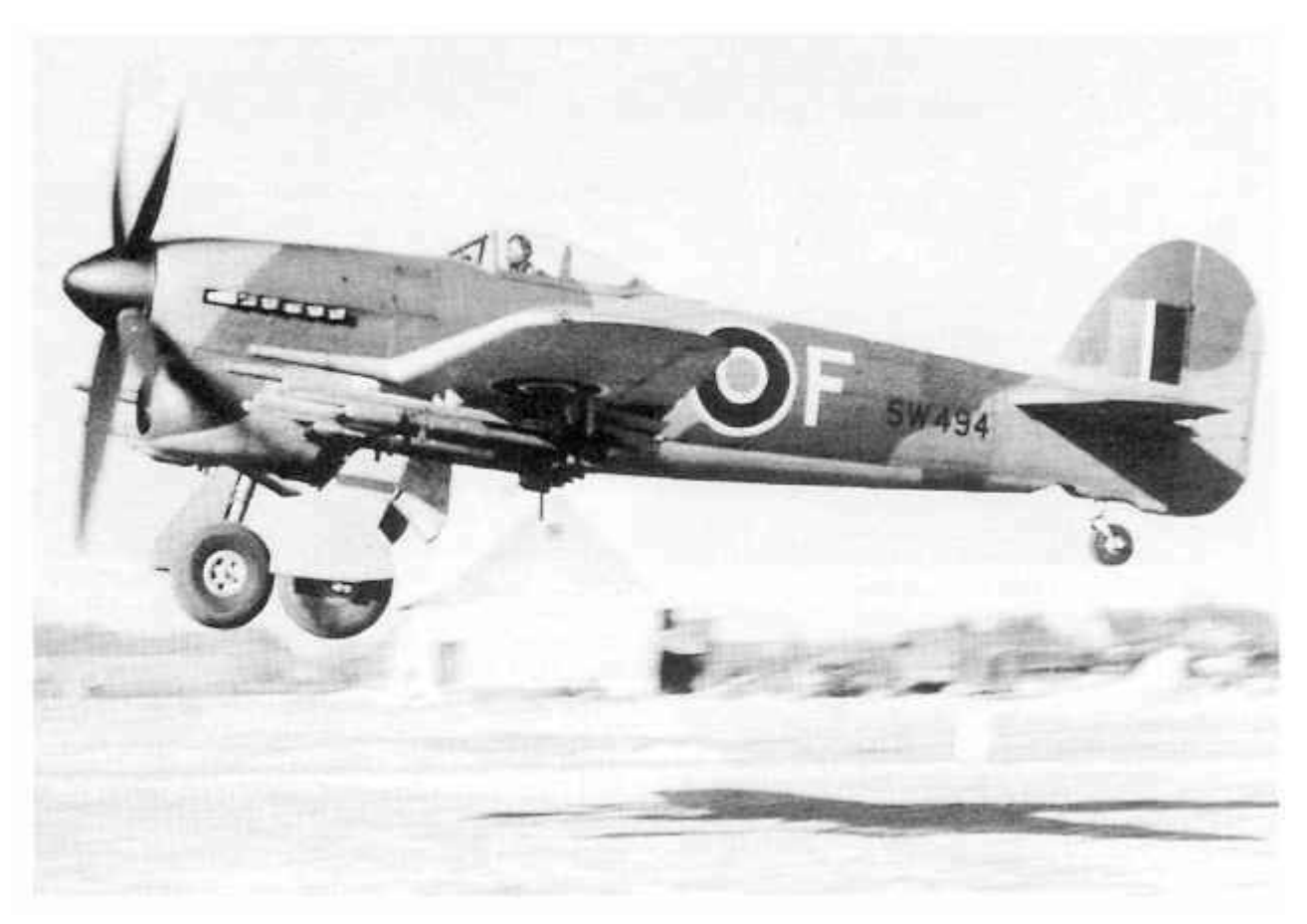
A Typhoon takes off on a mission carrying its potent load of eight 3-inch rockets. (CFPU PL 42738)

brief time "no bombing attack with demoralization as its primary object should be arranged unless it can in fact be readily followed up." Here were the elements of a new doctrine for the use of the heavy bombers in support of the land battle. Unfortunately at the end of August General Eisenhower lost control of the strategic air forces which returned to their preferred task of bombing targets in Germany.