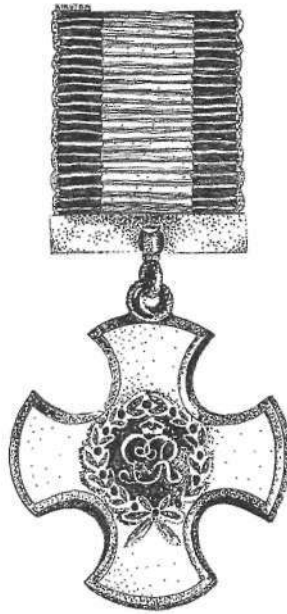
The Distinguished Service Order

In the case of the Camerons of Canada a recommendation for one additional DSO to a prisoner cannot be dealt with while the officer remains in enemy hands.