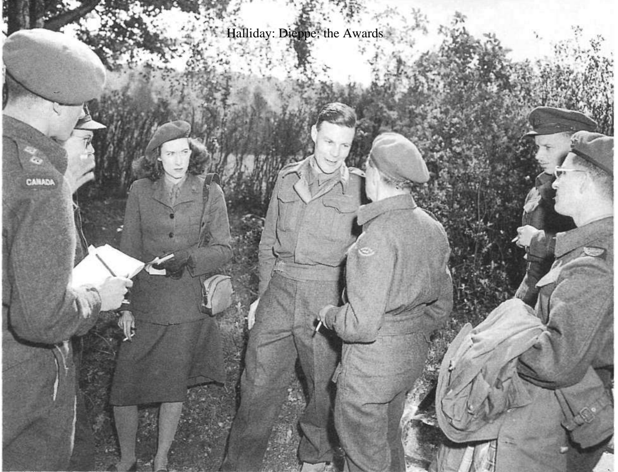
Lieutenant-Colonel C. C. Merritt, VC, being interviewed by correspondents shortly after his release from a prisoner of war camp, 21 April 1945. The award of a decoration, even a VC, to someone who had been taken prisoner was unusual.