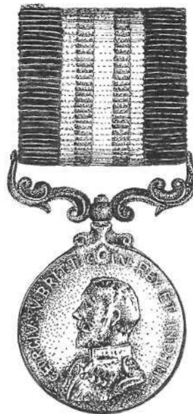
The Military Medal

The distribution of military honours following the Dieppe Raid is but one instance of how such awards were made. Authorities were concerned with striking proper balances; restrictive policies might leave courage unrecognized; excessive generosity risked dilution of the honours themselves. There were unwritten rules designed