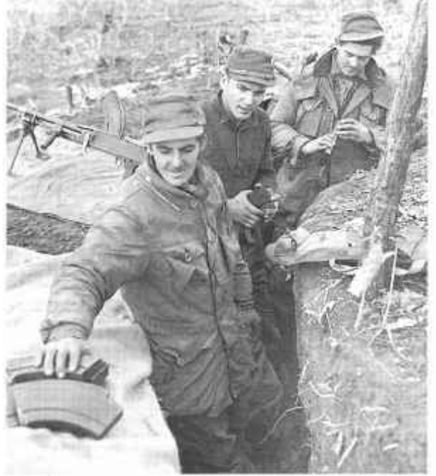
Men of the 2nd Battalion, Royal 22e Régiment and prepare for a patrol. Korea, December 1951. exp nor

1950, war exploded again, this time on the other side of the world in Korea. Within five weeks, the Canadian Government made the decision to raise a volunteer force to join the United Nations in repelling the Communist invasion. Recruiting went into full gear to form a brigade group built around battalions of the Princess Patricia's Canadian Light Infantry, Royal Canadian Regiment and Royal 22e Régiment. Jacques Dextraze, a veteran of the Second World War, was called back to lead