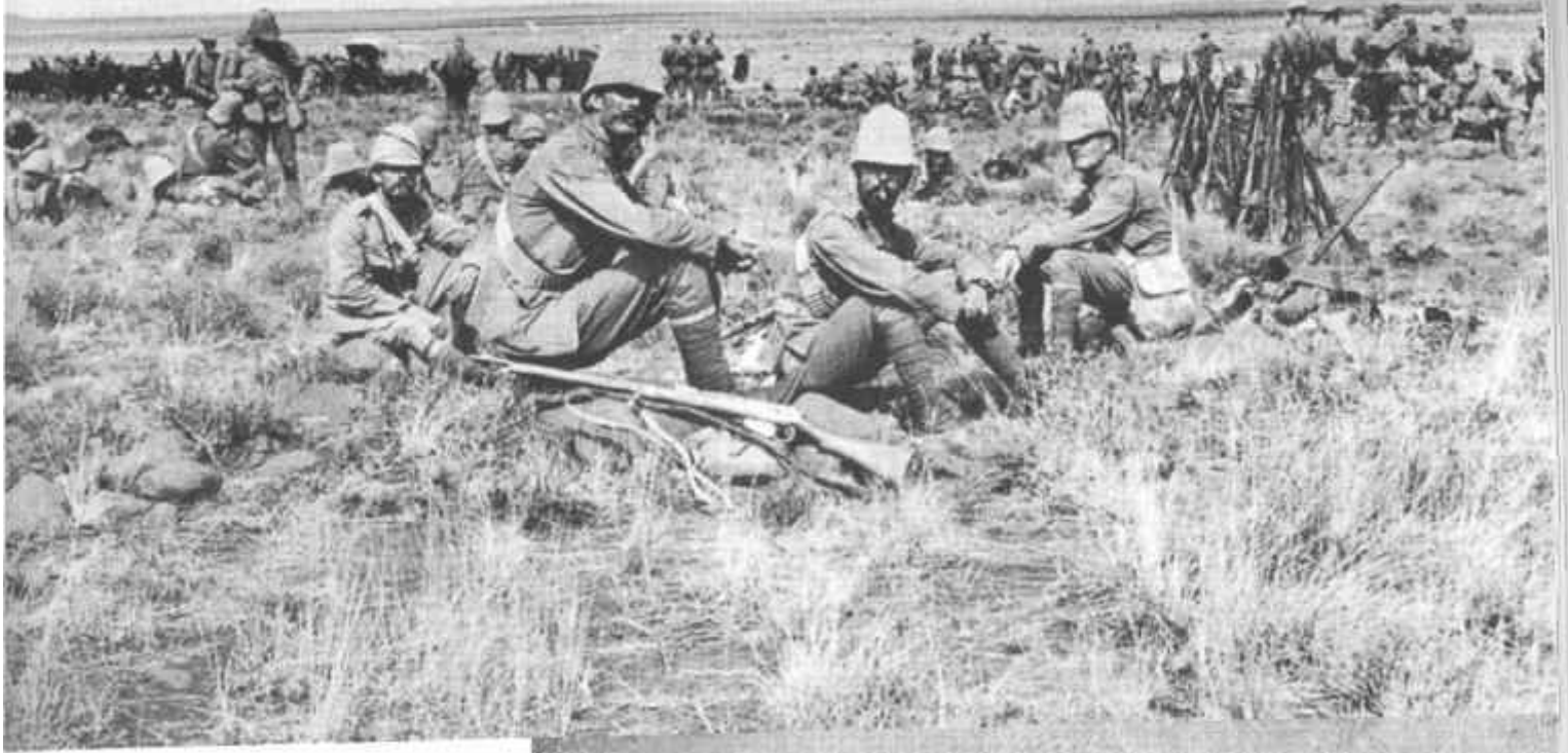
Above: A group of soldiers from the Royal Canadian Regiment rest on their way to Paardeberg, February 1900.