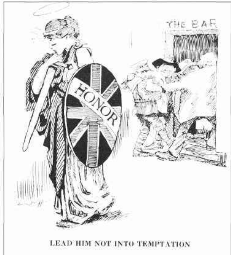
from Twenty-Five Cartoons on the War drawn by Clayton Duff and reprinted from The Welland Telegraph.

The temperance movement was not new in Canada, but the war proved to be a powerful stimulus for it by allowing advocates to effectively argue moral and economic reasons for prohibition. Anti-drink advocates were all too happy to mix the message of temperance with the war effort. Harnessing the twin motives of patriotism and guilt, groups like the Young Men's Christian Association (YMCA), church organizations, and the WCTU demanded that Canadians make a parallel sacrifice of alcohol for the war effort. As many people saw it, prohibition would be a chance to do something good and strike at the Hun from the homefront. How was one to argue with editorials that declared: "anyone who will vote in favor of liquor might as well enlist under the Kaiser as far as patriotism goes." 20 Abstainers extolled citizens to do all they could for their country, with "lolly-gagging" and drinking in pubs not conducive to the war effort. Those who failed to give up drink, were, in effect, hindering victory. Prohibition was patriotic. When 10,000 men, women and children marched on Toronto's Queen's Park on 8 March 1916, presenting a petition of 825,572 signatures to Premier William Hearst, a teetotaler himself, he felt compelled to bring in prohibition measures. 21 Those politicians who failed to heed