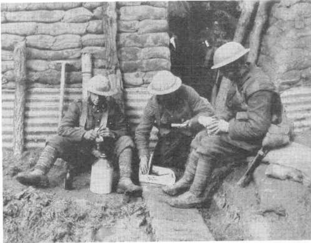
Canadian soldiers enjoy a quiet moment in the trenches, with a rum jug and beer bottles evident.