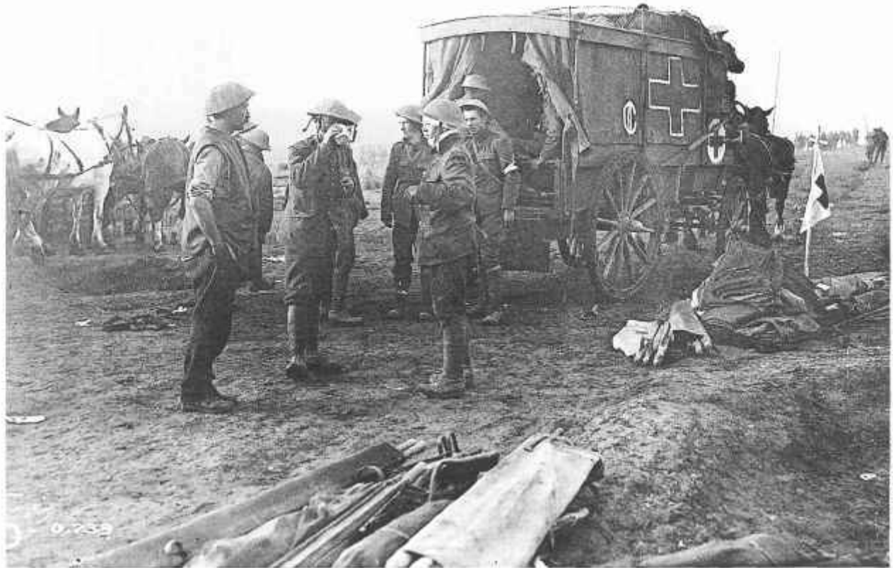
Rum was used to dull the pain of the wounded. Canadian soldiers receive a welcome drink at an advanced Dressing Station in France. September 1916.