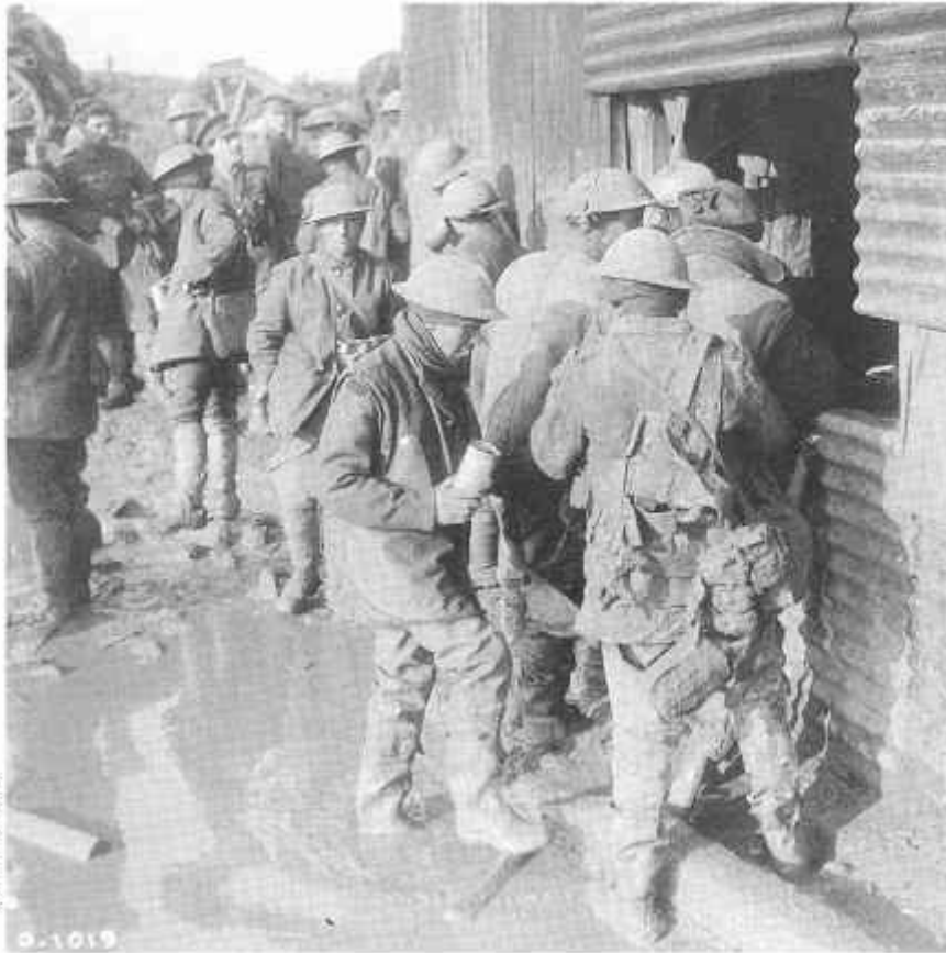
Behind the lines Canadians wait for refreshments, likely to be coffee or tea. Farther forward rum was the preferred drink. November 1916.

of war and akin in many soldiers' eyes to that of a religious offering. Each soldier waited patiently for his share, all the while aware that it was the higher-ranking soldier who divided up the portions, giving a little more or less depending on his whim. Just as rum was meaningful to the individual soldiers, it was also essential to the officers in helping to enforce their role in the primary group. If the enlisted men were against having their rum curtailed, it is also clear that it was not in the interest of the officers to support the temperance calls from the homefront. The politics of power were essential in all armies and the rum issue helped to support them. 65