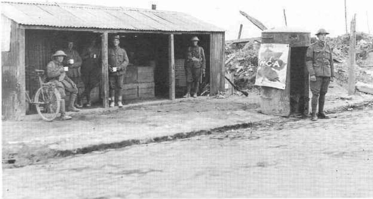
A YMCA hut provides non-alcoholic comforts to soldiers returning from the firing line, August 1917.