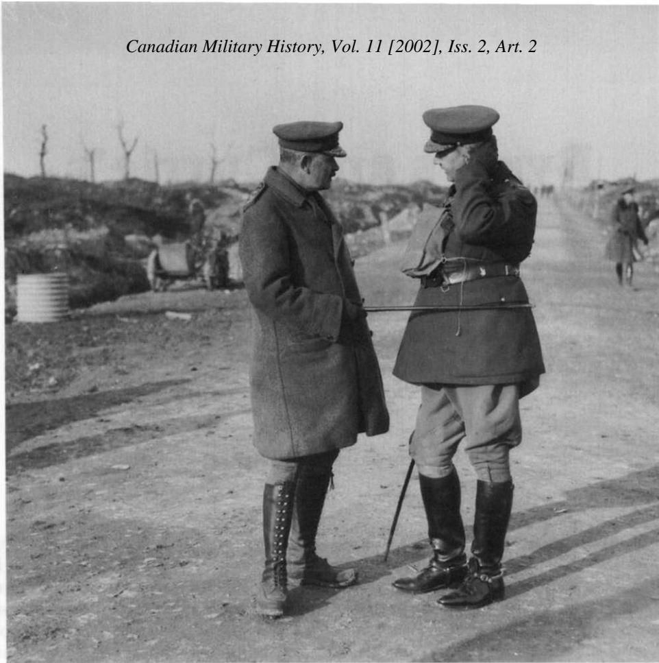
General Sir Julien Byng talking to Lieutenant-General Arthur Currie, February 1918.