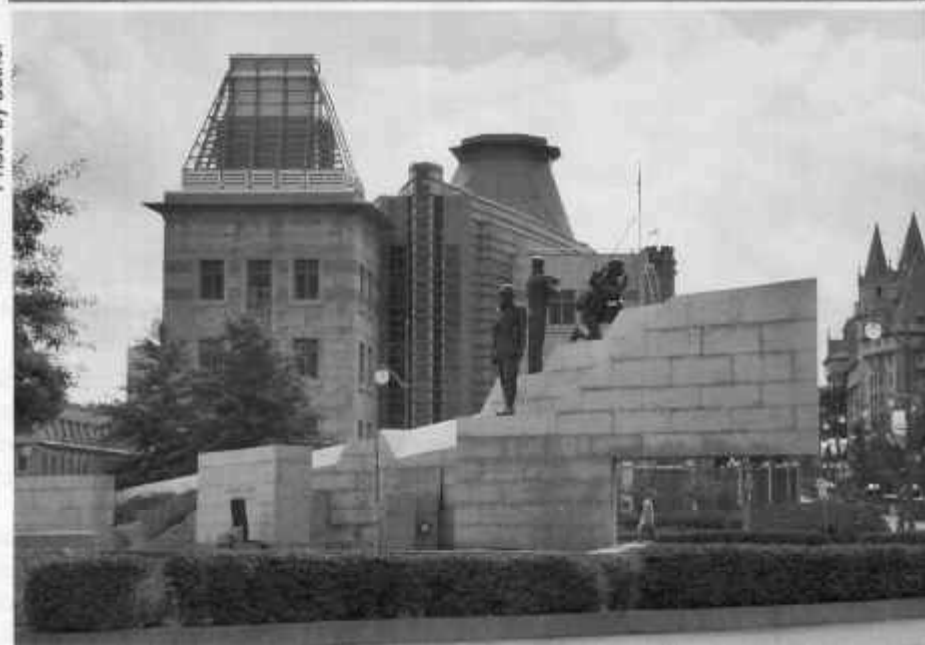
Figure 6 - Peacekeeping Monument with US Embassy building in background.

Despite the sense of enclosure, there is little relief from the noise of passing traffic. As an emblem, the monument is a little overwhelmed by the two adjacent post-modern structures: the glass tower of the National Gallery to the north and the unwelcoming glazed exterior of the US Embassy some 50 metres to the south (Figure 6). Surrounded by these new buildings the monument does not quite dominate the urban room for which it was intended.