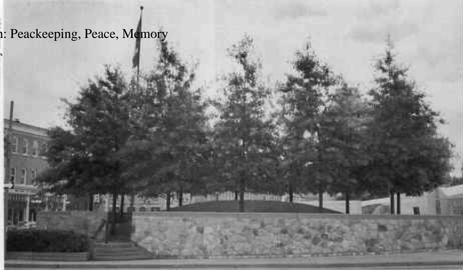
Figure 5 - Peace Grove Peacekeeping Monument, Ottawa