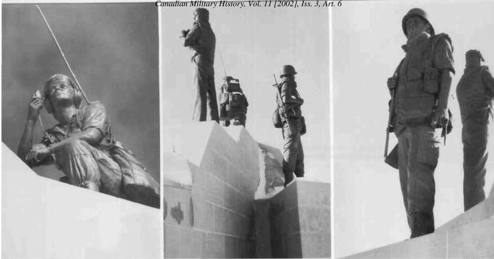
Figure 7, 8, 9 - Views of the three statues on the Peacekeeping Monument by sculptor Jack K. Harman.

complexity of the monument echo the ambiguities and complexities of the very act of peacekeeping and of peace itself? Further evidence of a lack of a unifying style is the 'peace grove,' which remains a visual sideshow.