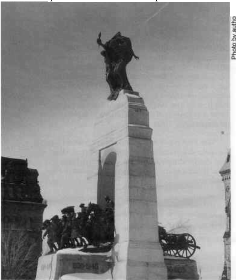
Figure 1 - General view of the Canadian War Memorial, Ottawa, sculptor Vernon March, 1939.

Originally required to "be expressive of the feelings of the Canadian people as a whole" 6 the winning design had to espouse the core values of post-war remembrance: "the spirit of heroism, the spirit of self-sacrifice, the spirit of all that is noble and great that was exemplified in the lives