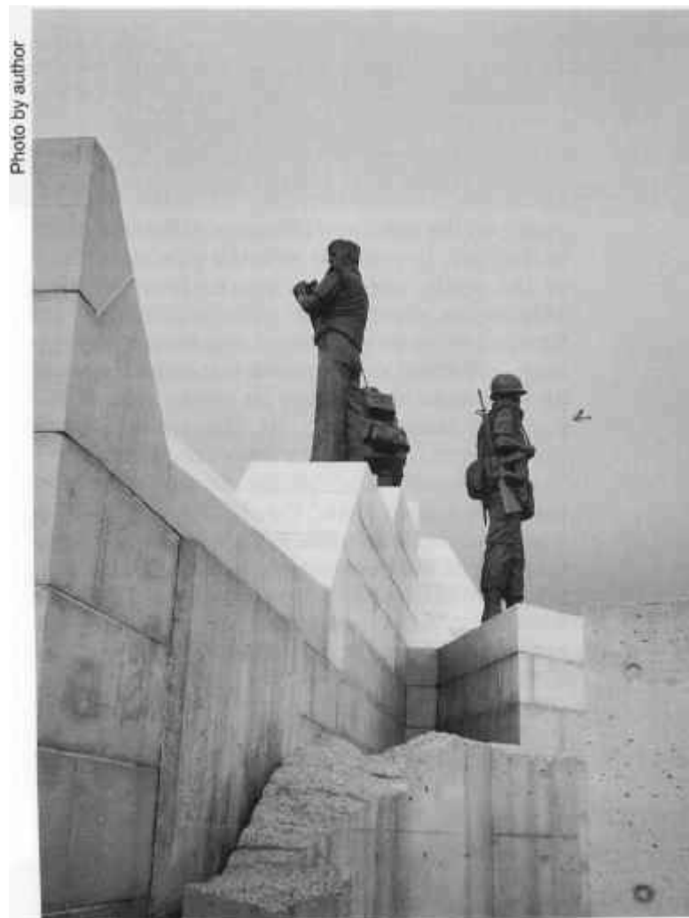
Figure 2 - General view of the Peacekeeping Monument, Ottawa.

As dramaturgical space the monument has considerable impact. The corridor is best viewed from the south-east, where the eye is drawn into the cleft by a pattern of floor tiles (modelled on the Green Line bisecting Nicosia, the capital of Cyprus) that meander around the chunks of sawn and drilled concrete littering the corridor floor (Figure 3). Approaching the apex of the two walls that form the sides of the corridor one becomes aware of the large cast bronze figures dominating the skyline. Two fissures in the corridor walls open out to reveal the ceremonial