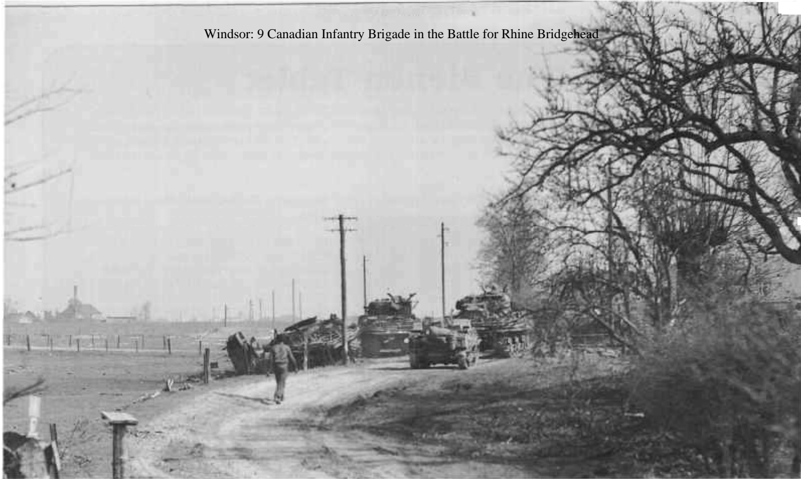
Two surviving Duplex Drive Sherman tanks pass the third of their troop "brewed-up" by a mine south of Speldrop, 24 March 1945. The Essex Yeomanry, equipped with DD Shermans, supported Scottish and Canadian units during the initial stages of Operation Plunder. Also note the flat, exposed terrain easily dominated by reinforced, multi-story houses.