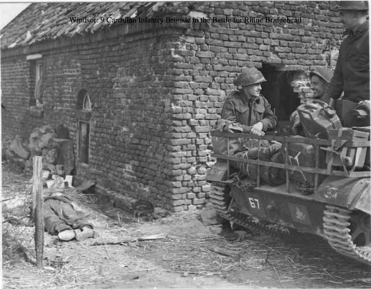
Soldiers for the HLI relax in the village of Speldrop after the battle has been won.

MAC PA 190843, courtesy of T. Robert Fowler