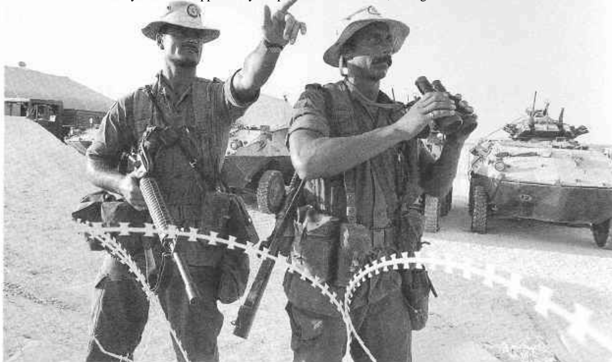
Two soldiers from 3rd Battalion Royal Canadian Regiment on patrol at Canada Dry 2 in Qatar. (CFPUSC 90-5050)

As the Canadian naval task group departed on 24 August for its "Persian Excursion," the first U.S. pre-positioning ships from Diego Garcia disgorged enough equipment for two U.S. Marine Corps divisions. By 25 August, the U.N. passed Resolution 665, which permitted the use of military force to back up the economic sanctions against Iraq.