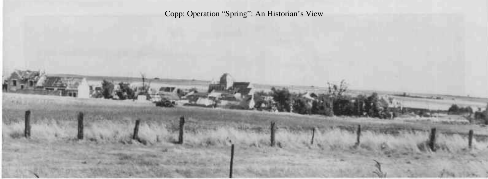
This photo shows the gentle slope of Verrieres Ridge, visible in the distance past the town of St. Martin-de-Fontenay.

aside from the three serious losses in leadership, were slight, amounting to ten or fifteen altogether.'