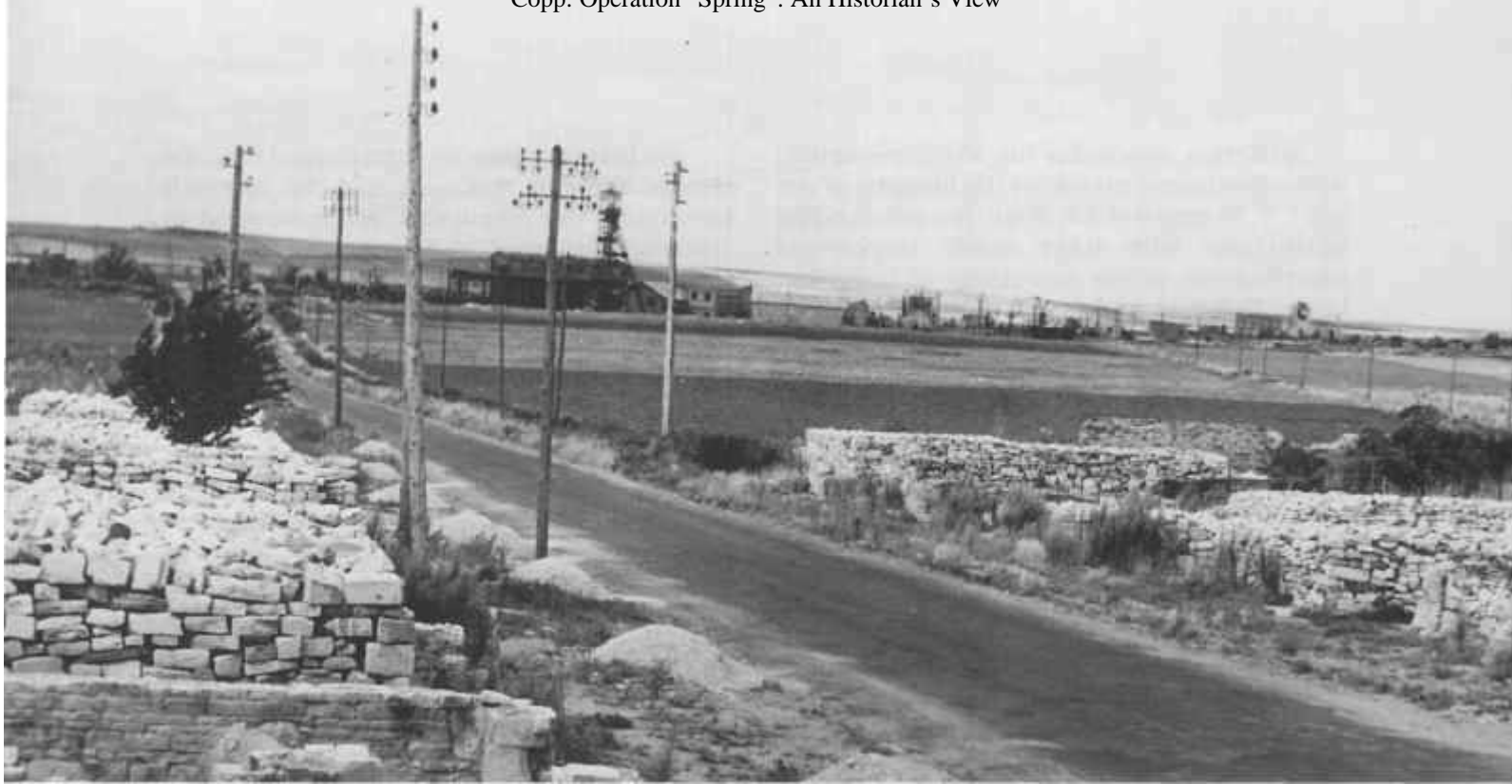
The mine tower in the "factory" area is visible in this photo taken from the north edge of May-sur-Orne looking north. The high ground in the background is Point 67. The low, square tower on the right is the church in St. Martin-de-Fontenay. This photo was taken in 1946.

carry on." 13 On top of the ridge the remnant of the battalion "ran directly into a strong and exceptionally well camouflaged enemy position." 14 Tanks and self-propelled guns were concealed in haystacks and intense close-range fire forced the men to ground. Griffin, who may have been the only officer left, ordered a withdrawal - "every man to make his way back as best he could." Not more than 15 soldiers were able to do so. Griffin's body was later found "lying among those of his men." 15