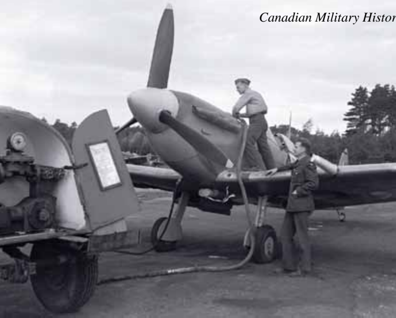
CFPU PL 10706

the running commentary given by the controller in Headquarters Ship No. 2. There is no doubt that this local control was largely responsible for the high percentage of interceptions made on enemy aircraft, thus greatly minimising the effectiveness of enemy air attack on ships and troops.