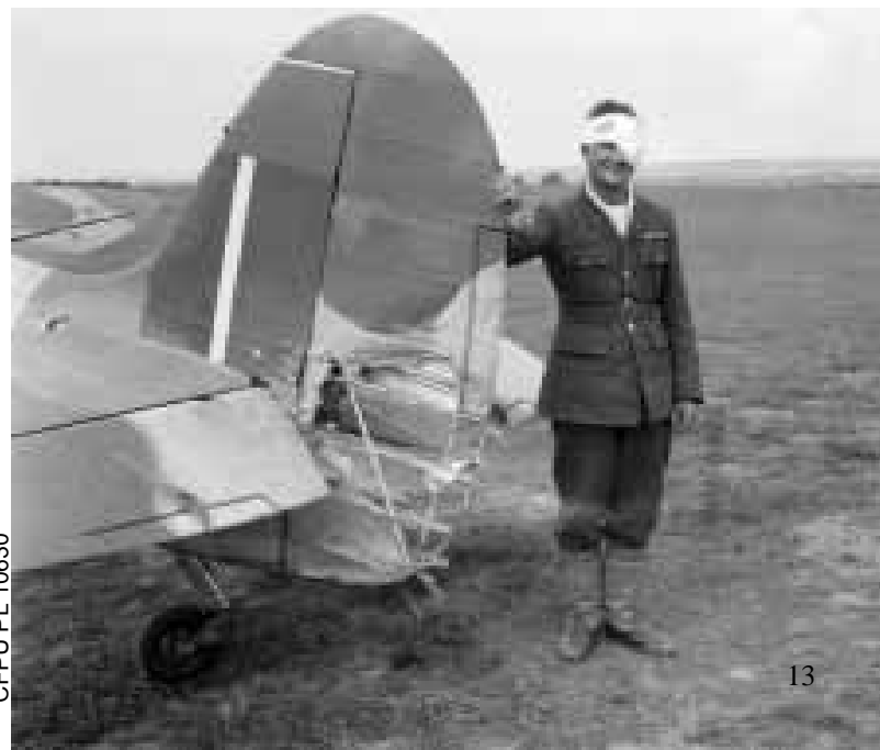
CFPU PL 10629 CFPU PL 10630