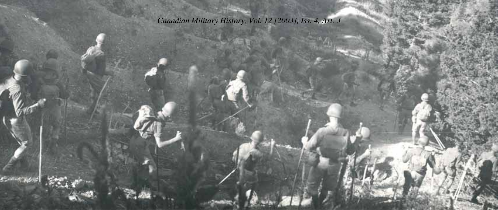
Forcemen pick their way down a ravine during a September 1942 route march near Helena, Montana. The walking sticks are being used as substitute ski-poles in preparation for ski training during the winter months.

Modest and unassuming, Frederick always insisted that his selection to command the FSSF came as a result of other, more qualified officers turning down the job. 3 Indeed, Frederick's initial reaction to Eisenhower's offer was to protest that he was completely unqualified for the position, noting in particular his complete lack of infantry training and his unfamiliarity with parachuting, mountain operations, and winter warfare. 4 These objections were duly noted and ignored, perhaps due to the fact that Eisenhower was leaving for the UK in a few days to take command of the US European Theater of Operations and did not want to leave behind any loose-ends in Washington. Another possibility is that Lord Louis Mountbatten, the British Chief of Combined Operations and a key proponent of Operation PLOUGH, had some influence in the decision and viewed Frederick's appointment to command the Force as an ideal means of silencing his criticism of the project. 5 Regardless of the reasons, on 2 July 1942, the First Special Service Force was activated by an order of the US War Department, with the newly-promoted Colonel Robert T. Frederick as the officer commanding.