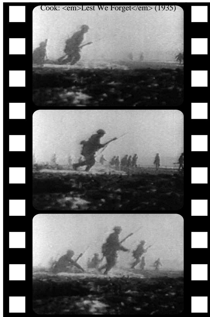
Still images of soldiers leaving a trench captured from the film Lest We Forget .

This night of relived memories became the focus for an intense debate in the media, in Parliament, and among veterans. Lest We Forget was discussed, critiqued, and celebrated over the coming months as it was shown across the country. There was no meta narrative, no uniform discourse: some newspapers and letter-writers saw it as the glorification of war while others found it coloured distastefully by an antiwar fervour; some argued that all citizens of the country should see the film, others thought it too horrific for children, and much too dangerous for the vast unemployed men who might either join