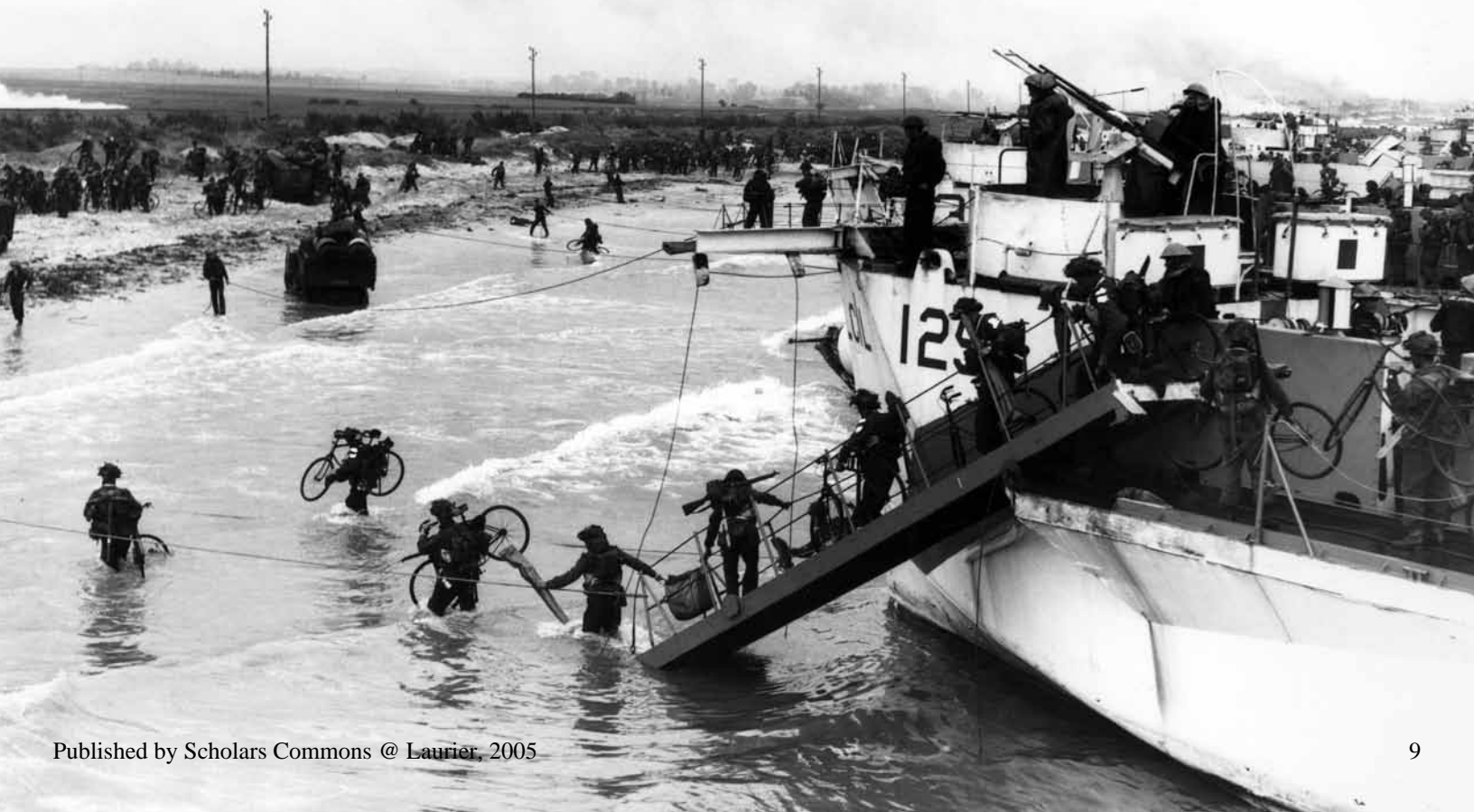
Troops from the 9th (Reserve) Brigade come ashore at Bernières-sur-Mer on the afternoon of D-Day. Note the bicycles being carried ashore to give increased mobility to the Brigade.