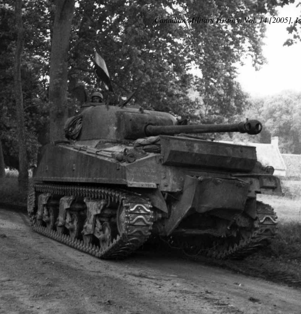
A Sherman VC (Firefly) of 2nd Canadian Armoured Brigade near Courseulles-sur-Mer, 8-10 June 1944.