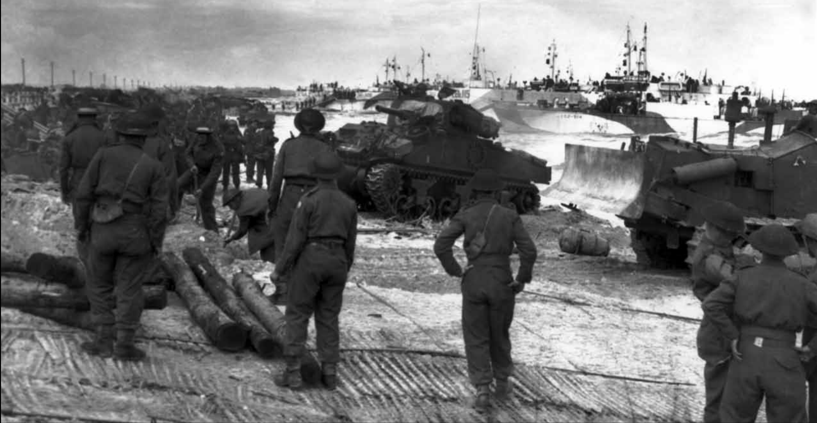
Juno Beach on the afternoon of D-Day. This is the sector at Courseulles-sur-Mer where 7th Canadian Infantry Brigade, supported by the tanks of the 1st Hussars, landed.

and the stench of hundreds of German dead added to its unpleasantness. The enemy delivered two counterattacks against the Regina Rifles every night, their Panther tanks even entering Bretteville to the very doors of the Battalion Headquarters.