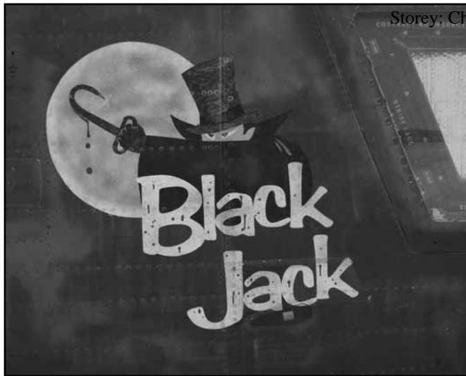
Storey: Chinook Nose Art