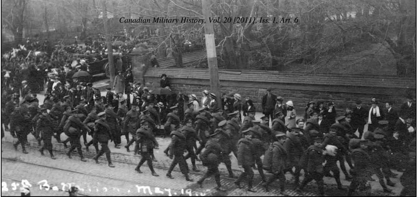
Above and opposite: 25th Battalion marching along South Park Street turning into Spring Garden Road, Halifax, before embarking for Europe, May 1915.

taken like a man without whimpering or resentment. Where resentment did arise it was usually due to being wrongly accused and punished, or in feeling the sentence too severe or vicious when given for some minor offence.