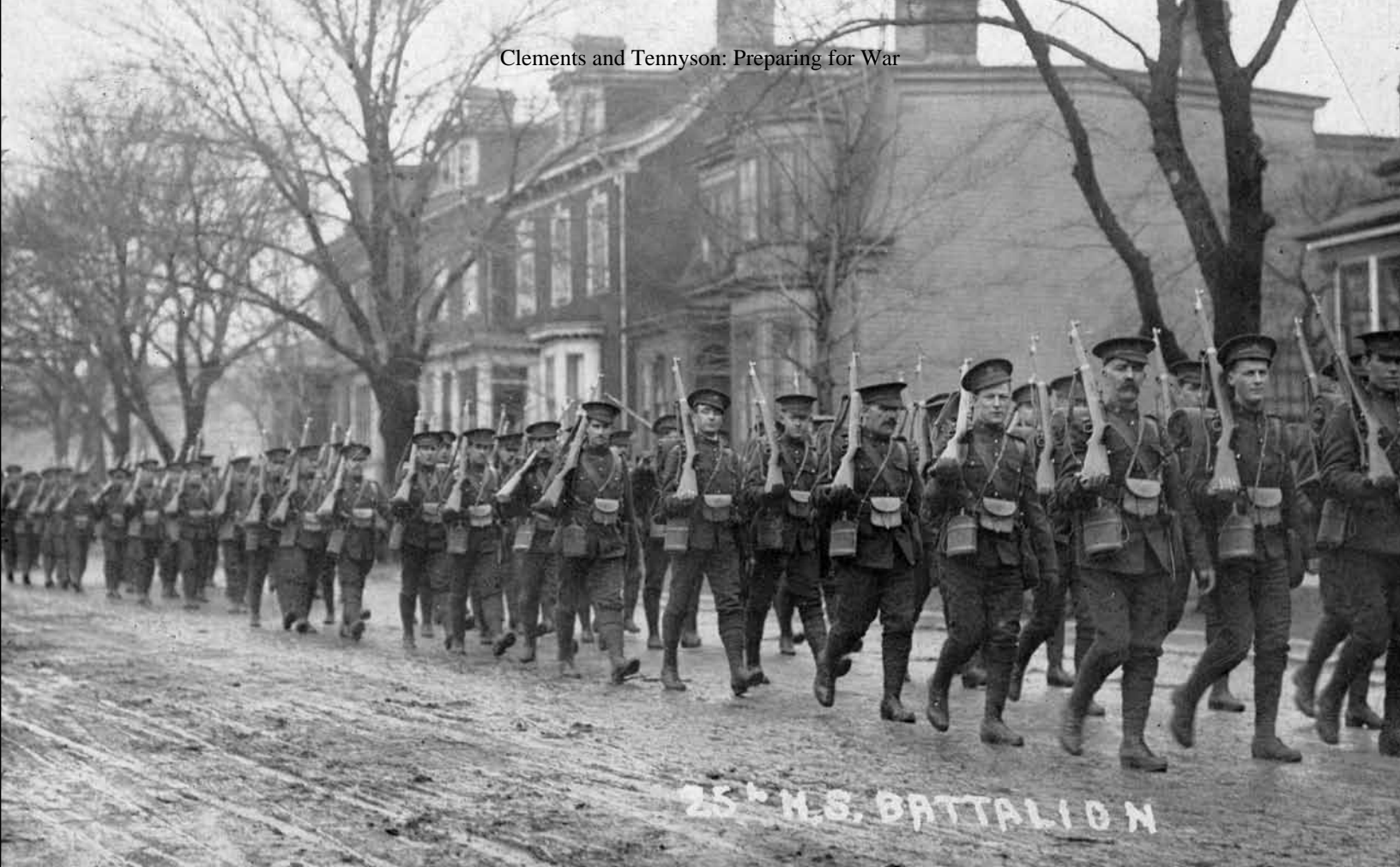
This postcard shows men of the 25th Battalion marching through Halifax, carrying their Ross Rifles, ca.1915.