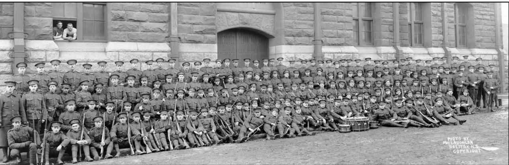
"C" Company, 25th Battalion, Canadian Expeditionary Forces in front of Armouries.

All men were required to shave daily. No excuses were accepted for lack of attention to this detail. Clothing was expected to be brushed clean with nothing torn or out of place. Boots had to be thoroughly clean and polished. The same applied to belts and all other leather equipment worn on parade. All buttons and badges must be in place, with none missing.