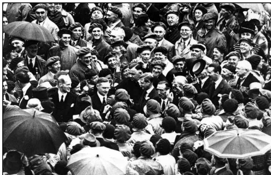
Top: King Edward VIII inspects the guard of honour; Above: King Edward VIII is surrounded by a group of adoring pilgrims during the garden party held at Buckingham Palace in London following the dedication ceremony at Vimy.

by trains. British veterans waiting at the railway stations gave them a hearty welcome. This portion of the trip was organized by the British Legion, which missed no opportunity to highlight the unity of the Empire. Our Empire , the British Legion's magazine, honoured the pilgrims of the "Second Canadian Expeditionary Force," observing that this act of commemoration and unity would "rebind the Imperial brotherhood in awakened memories of a common sacrifice," and that with the coming war, "they can do it again." 94 Such sentiments were