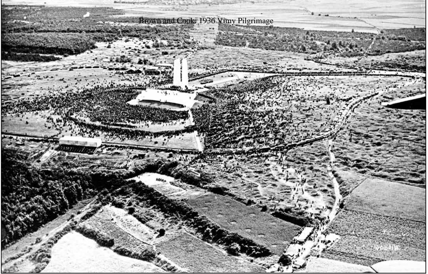
A large crowd of pilgrims and French onlookers gather at Vimy for the dedication of the monument, 26 July 1936.

marvellous sight to look down and see the thousands of navy and khaki berets." 78