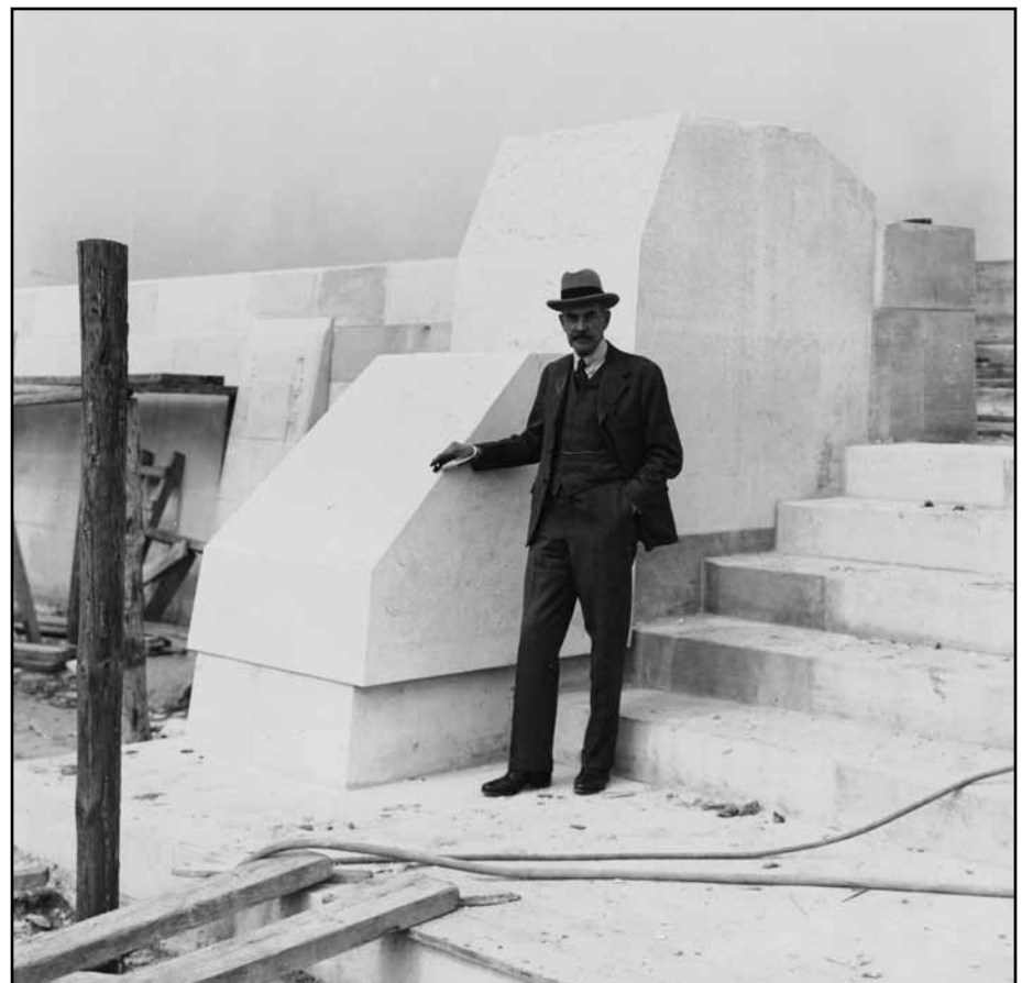
Walter Allward, the designer of the Vimy Memorial, stands beside his masterpiece as it is constructed.

Tours to the Western Front battlefields began soon after the Armistice with veterans and civilians from Britain making the short and inexpensive trip across the English Channel to France and Belgium. They went for a number of reasons: to find the grave of a loved one, to accompany a veteran, or perhaps