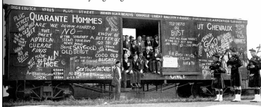
Brown and Cook: 1936 Vimy Pilgrimage