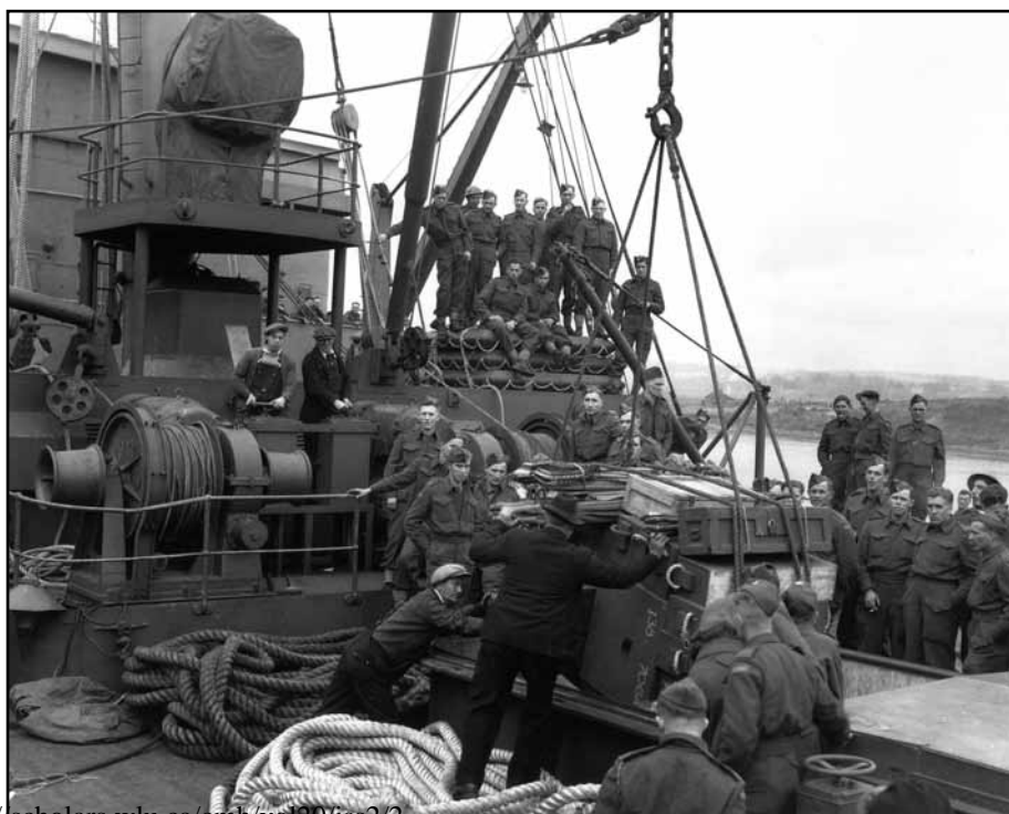
Bottom left: Civilian stevedores load military equipment aboard HMT Awatea prior to its departure from Vancouver for Hong Kong, 27 October 1941.

something as simple as mortar bombs was not commented upon by the Royal Commission.