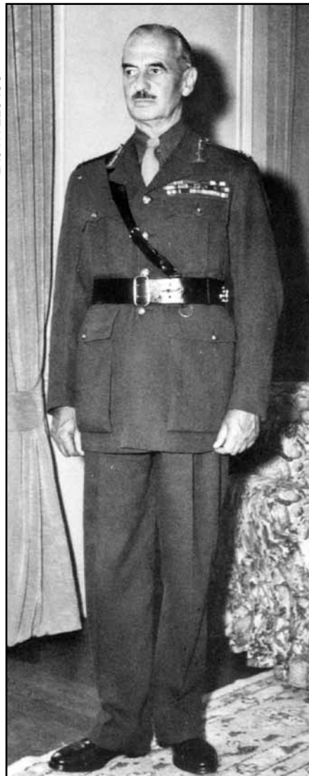
LAC PA 116456

The two men had studied the problems of defending Hong Kong at the Imperial Defence College in 1934 so there was a wide ranging and informal discussion of the issues. The minister of national defence, J.L. Ralston, joined the conversations and heard Grasett argue that "two additional battalions" would render the garrison strong enough to withstand, for an extensive period of siege, an attack by such forces as the Japanese could bring to bear against it. 10 Grasett also learned much about the state of the Canadian army and the concern that recruiting was suffering because there were no signs that the Canadians were likely to become involved in action overseas. According to Crerar, Grasett did