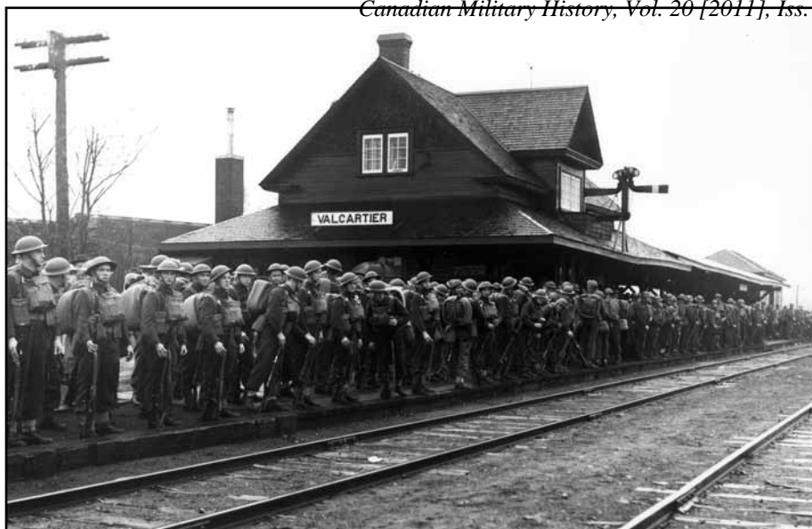
Top left: Soldiers of the Royal Rifles of Canada wait at the Valcartier train station to begin their journey to Hong Kong, 23 October 1941.