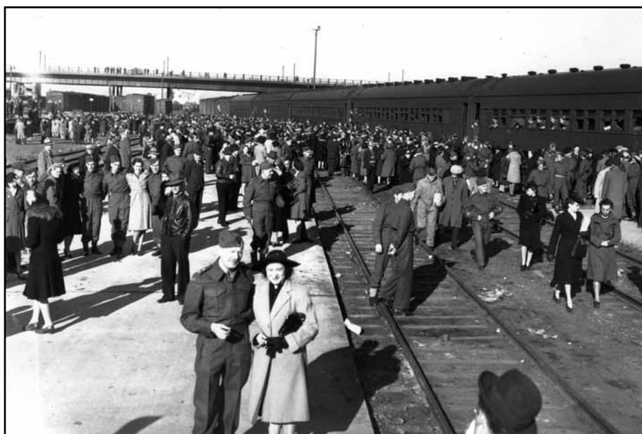
Middle left: Soldiers of the Winnipeg Grenadiers mingle with their families before entraining for the west coast and ultimately Hong Kong, 25 October 1941.