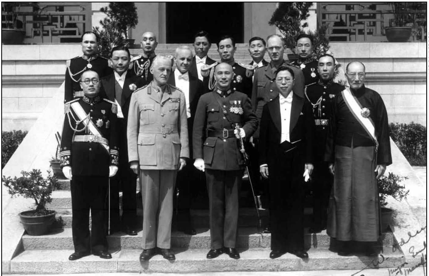
Canadian ambassador to China, Major-General Victor Odlum, with Chiang Kai-Shek and other Chinese officials and dignitaries, 15 March 1944.