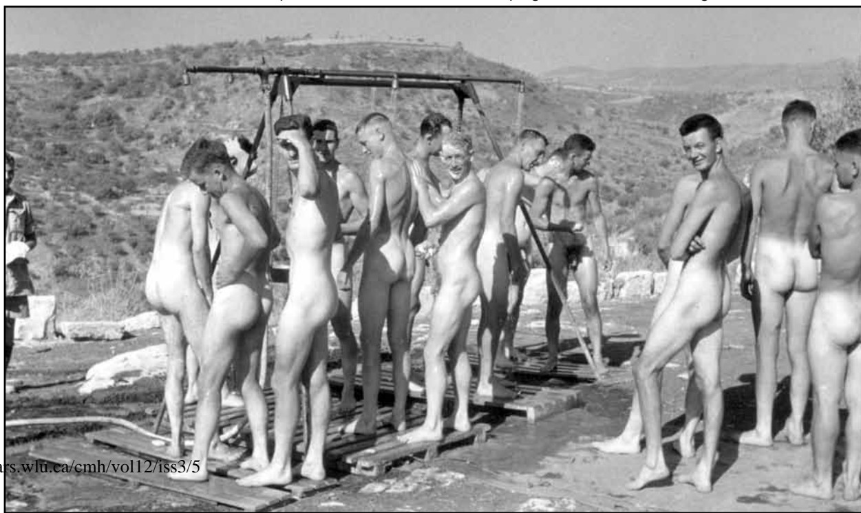
Canadian soldiers clean up at the end of the Sicilian campaign, near Adrano, 18 August 1943.

The original of this document can be found at the National Archives of Canada, RG 24 Volume 10880.