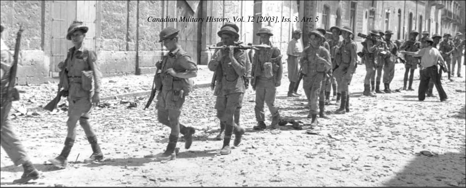
A Canadian patrol makes its way through the streets of Valguarnera, 19 July 1943.