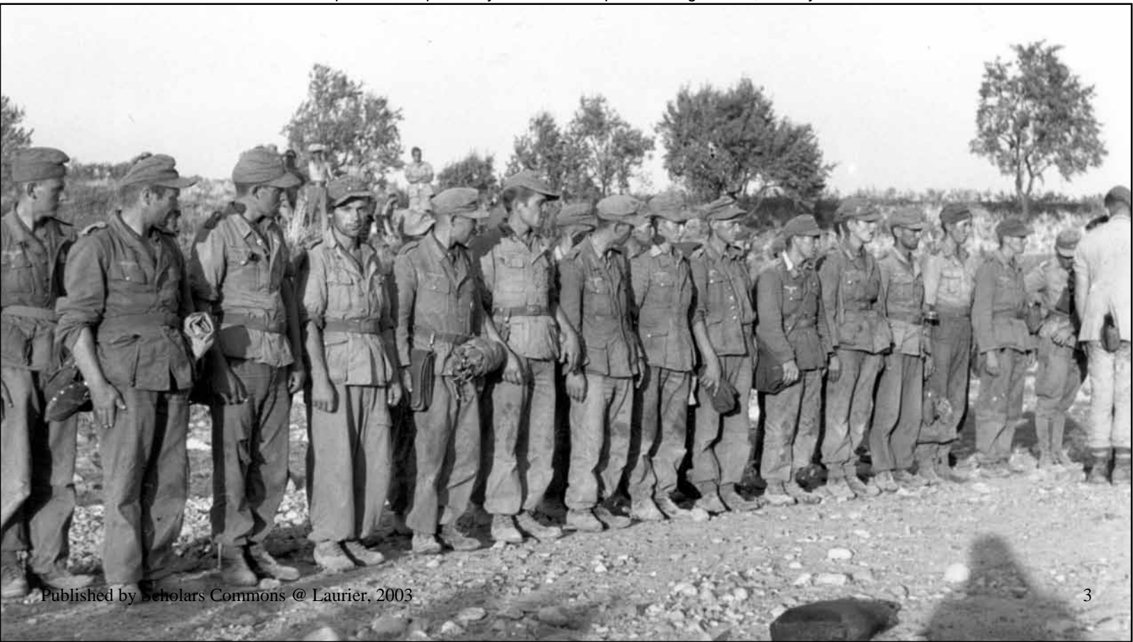
German prisoners captured by Canadian troops near Valguarnera, 17 July 1943.

On the night of the 15 July we left GIARRATANIA at about 2400 hours and moved just south of VIZZINI where the 51 (Highland) Division had been halted. We were thereupon turned off the road on orders from the Brigade and rested in a field. The following morning (16 July) at first light we passed through the 51 (Highland) Division and were then in occupation of VIZZINI, preceded by the Hastings and Prince Edward Regiment. Up to this point we had had no fighting, although we did have some contact with the Italians who had packed up in all cases. It was at VIZZINI that we heard for the first time of any troops contacting Germans. At the next town, GRAMMICHELE, the Hastings and Prince Edward Regiment ran into some definite trouble but they were able to clear the enemy from the forward reaches of the town by 1200 hours. I was called upon by the Brigade commander to furnish a recon patrol and carriers to enter GRAMMICHELE and see if it was entirely cleared of enemy. Since our carriers had gone down with the CITY OF VENICE, I borrowed