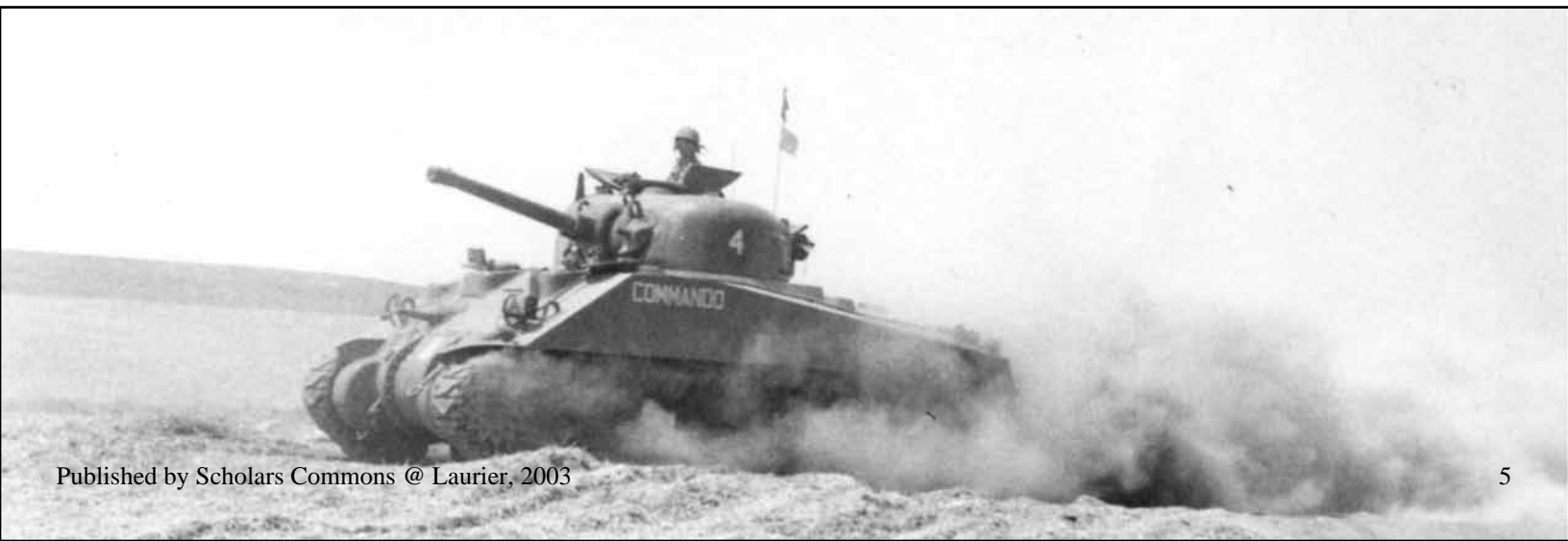
A Sherman tank from a Canadian armoured regiment moves across a dusty Sicilian plateau, 3 August 1943.