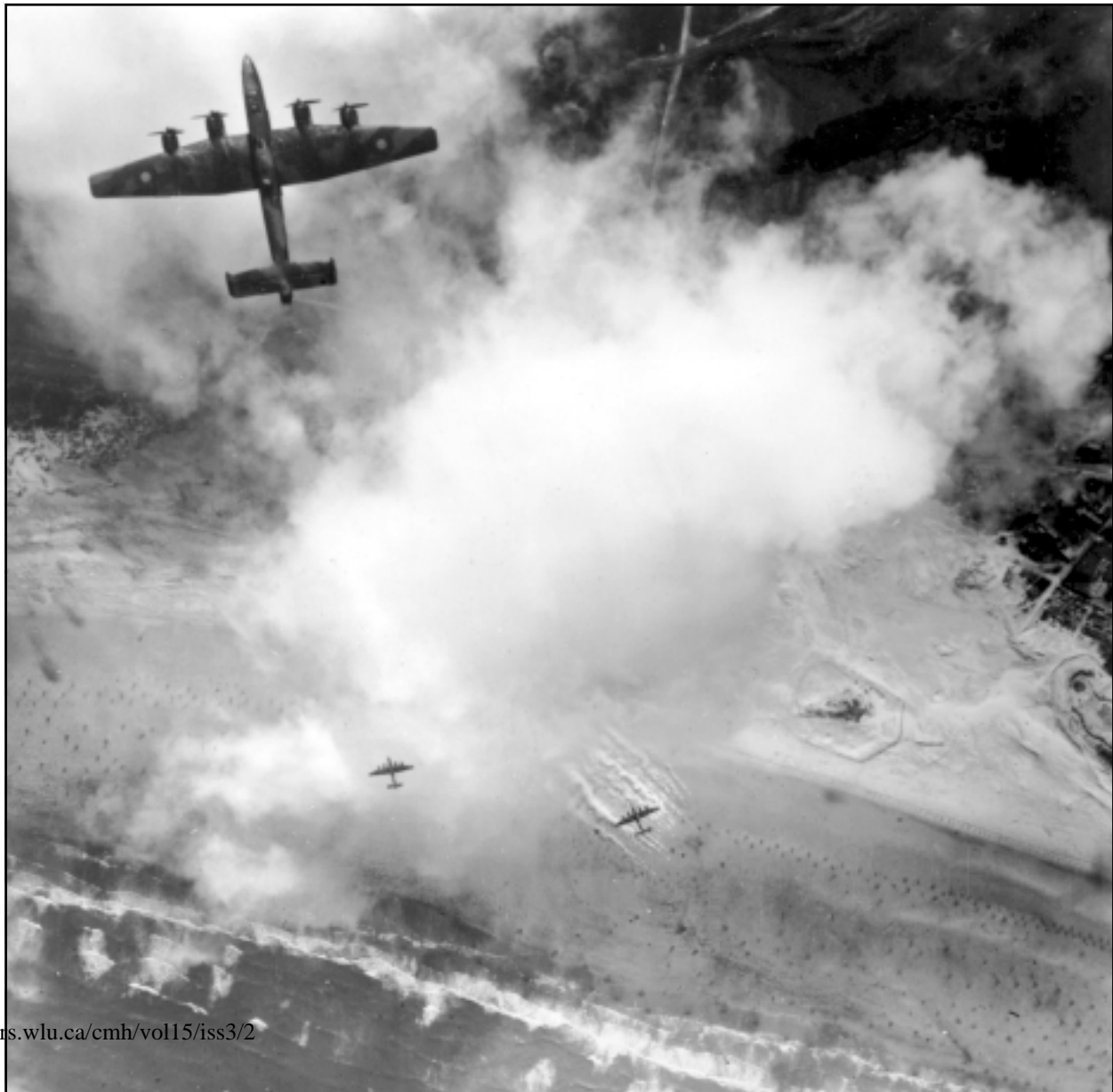
Laurier Centre for Military Strategic and Disarmament Studies (LCMSDS) Photograph Collection

Halifax aircraft of RAF Bomber Command cross the coast near Calais, France during a daylight attack in support of the Canadian operation to capture Calais, 25 September 1944.