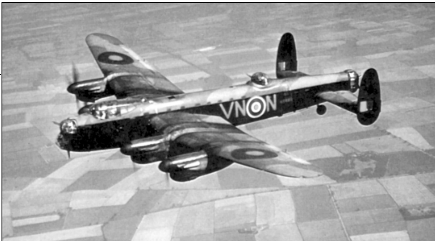
An Avro Lancaster I.

American B-29. Vickers took up the challenge and produced, in the words of one authority, “the most elegant of British heavy bomber designs,” and one which was “the ultimate expression of British concepts for piston-engine design in its class.” 6 But the third – and last – prototype of