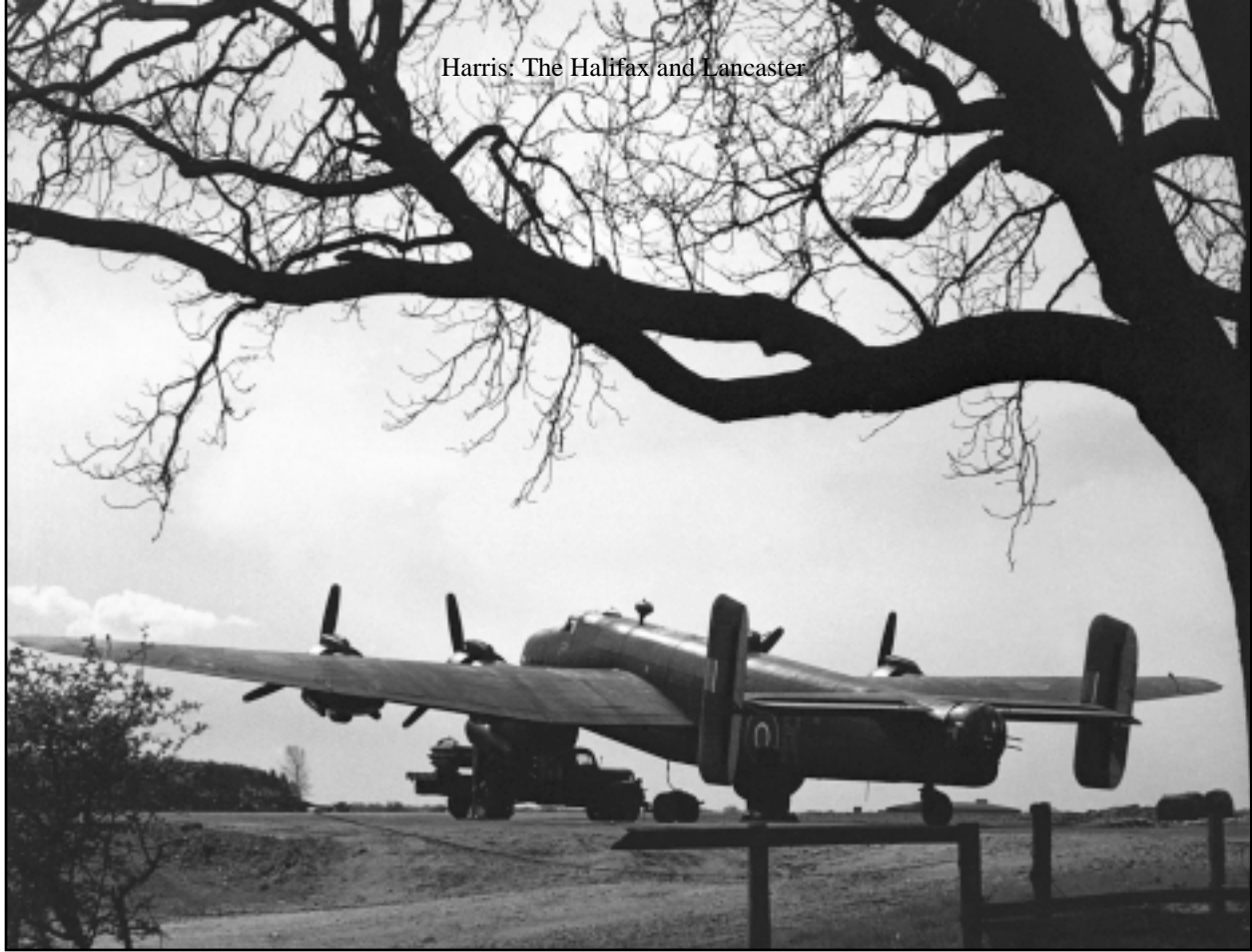
A Handley-Page Halifax Mark III of 426 Squadron at dispersal.

miserable manoeuvrability at altitude, too little speed for evasive turns, and a nasty tendency to roll over if the turrets were rotated (to follow a night fighter) while the pilot was engaging in evasive manoeuvres. 21 Moreover, the exhaust shrouds were so ineffective that Halifaxes could be seen from as far away as five hundred yards from dead astern. Unhappily, Portal informed the prime minister, finding ways to reduce the visibility of exhaust flames was a major problem of “considerable difficulty.” 22