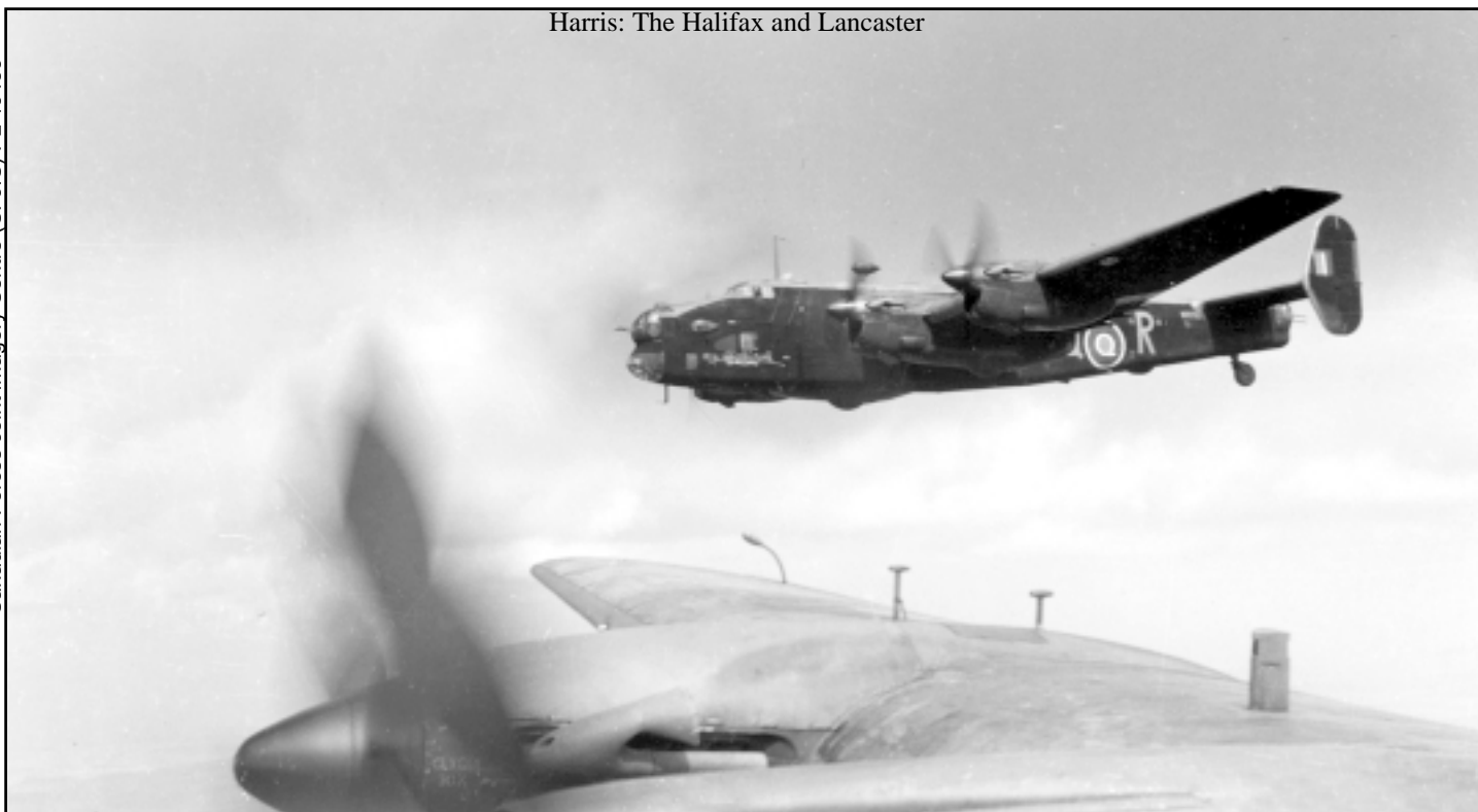
A Handley-Page Halifax Mark I or II of 405 Squadron RCAF, with early style vertical stabilizers and the nose-mounted Boulton Paul turret, in flight.

service ceiling of 38,500 feet, a speed of 345 miles per hour at 31,000 feet, a bomb load of 8,000 pounds, and remote-controlled, cannon-equipped, and radar-directed barbettes as defensive armament – a machine that would have been comparable in every respect to the