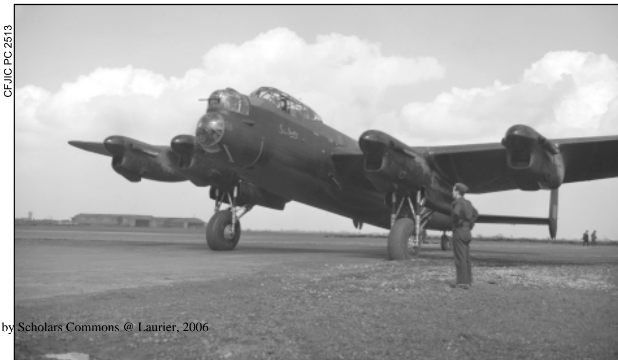
A 434 Squadron Lancaster X, 'S for Smitty,' photographed late in the war.

Additional evidence that all was not well with the Halifax III was not long in coming, as on 21