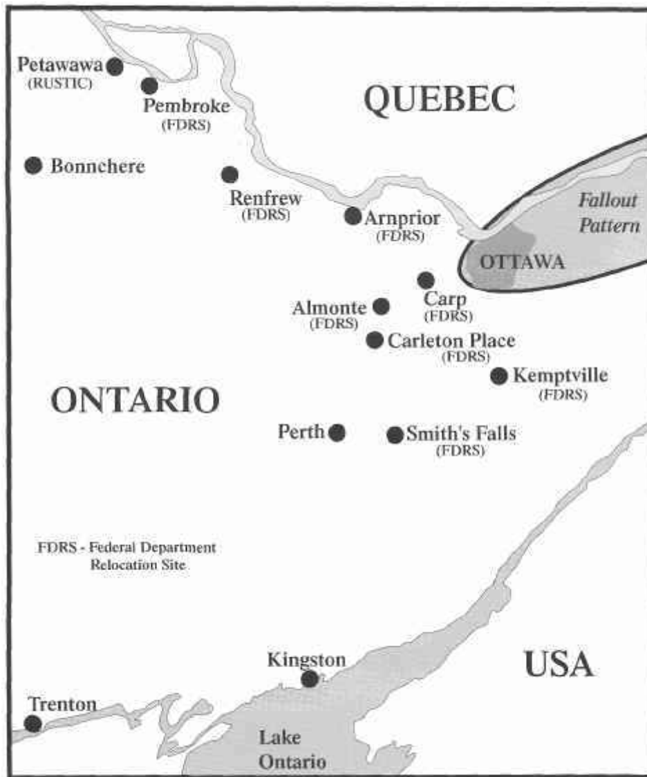
Map 2 - The RUSTIC Plan, 1959-1960 and Federal Department Relocation Sites

underground buildings: a communications centre, an administrative centre, and an executive centre. Each would house 500 people. Some planners considered this to be too vulnerable: all three buildings, though underground, were clustered together and there was only one communications centre. An alternative was to split the communications between two 750-man buildings and put more distance between them. This lowered the administrative efficiency of the complex and increased costs, since communications would have to be duplicated. 31