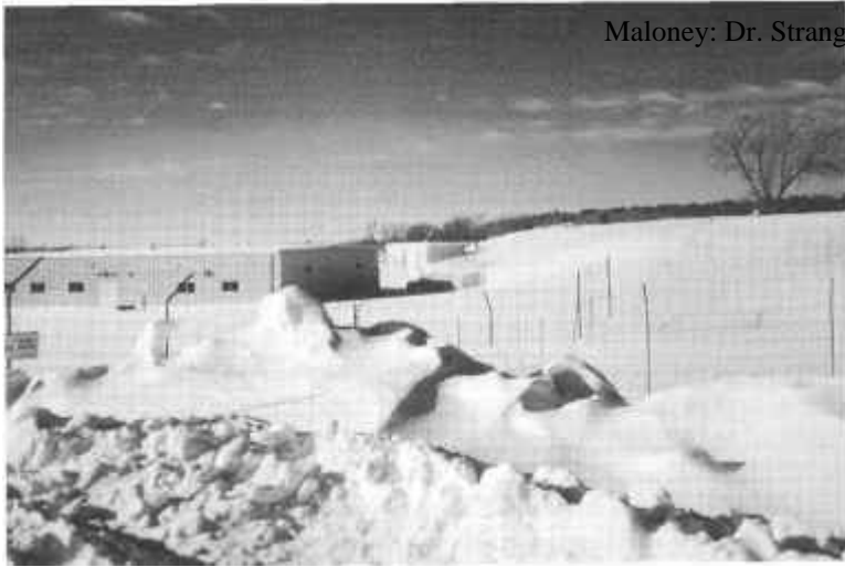
Two views of the EASE facility or the National Emergency Headquarters at Carp, west of Ottawa