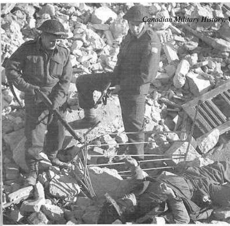
Left: Canadian soldiers look at the body of a dead German in Ortona, 30 December 1943.