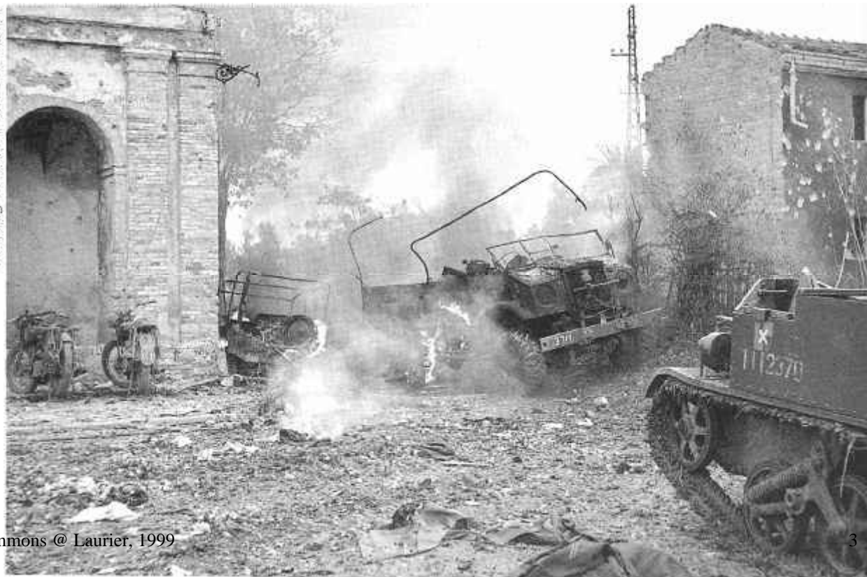
A Canadian truck and jeep burning after being hit by German mortar shells, Ortona, Italy, 23 December 1943