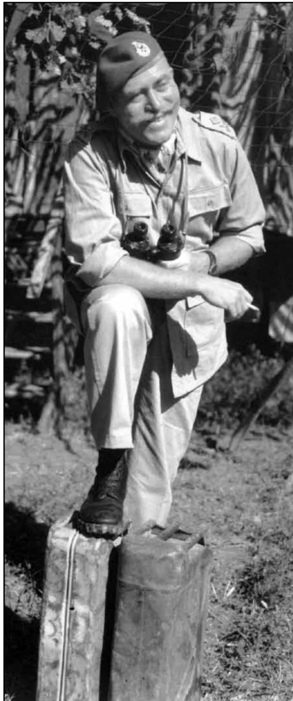
Major-General Chris Vokes, general officer commanding, 1st Canadian Infantry Division.

Decisions made at the theatre level also shaped the future Canadian battles. Rome was the next major objective, but taking it presented a significant problem for the Allied ground commander in Italy, General Sir Harold Alexander, who commanded the 15th Army Group. Geographically separated by the Apennine Mountains, the Eighth and Fifth Armies were operating practically independently of each other, with the former advancing in the centre and along the Adriatic coast while in the west the Americans were nearing Naples. Given the estimated German strength in Italy, it was clear that the Fifth Army lacked sufficient combat power to take Rome on its own, and so by 8 November 1943 Headquarters 15th Army Group, with considerable input from Montgomery, produced a coordinated plan of attack that would involve both formations. 7 The Eighth Army operation, code-named Encroach, was intended to begin on 20 November. Lieutenant-General