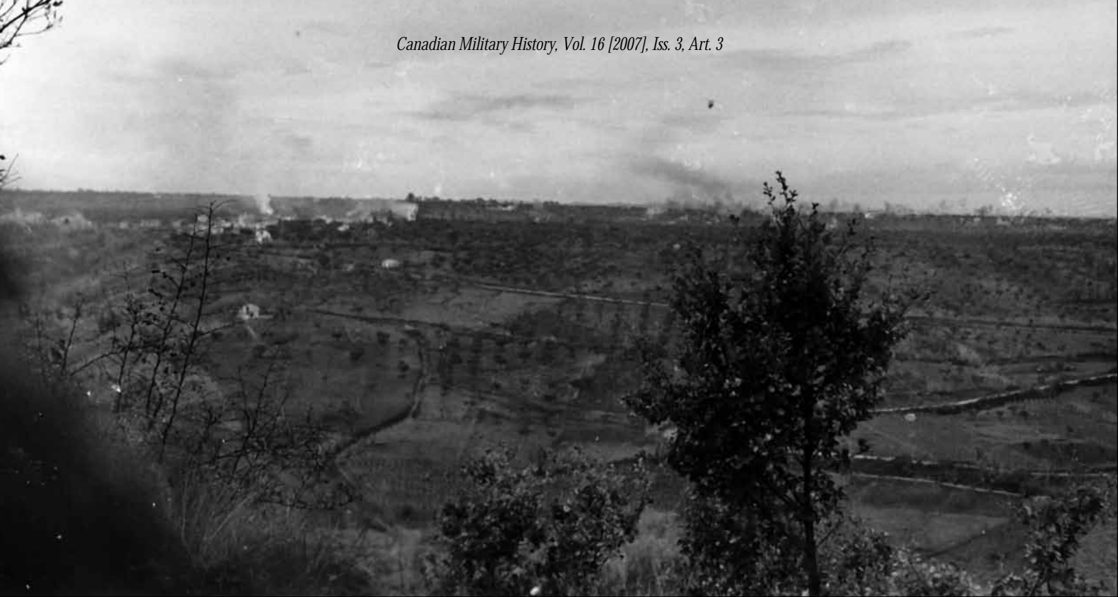
An aerial view of the Canadian artillery barrage which preceded the attack on the Moro River by 1st Canadian Infantry Division, 8 December 1943.

dismounted infantry in mountainous terrain, 32 the amount that the mules could actually carry was limited. The mules could only augment, not replace, wheeled transport.