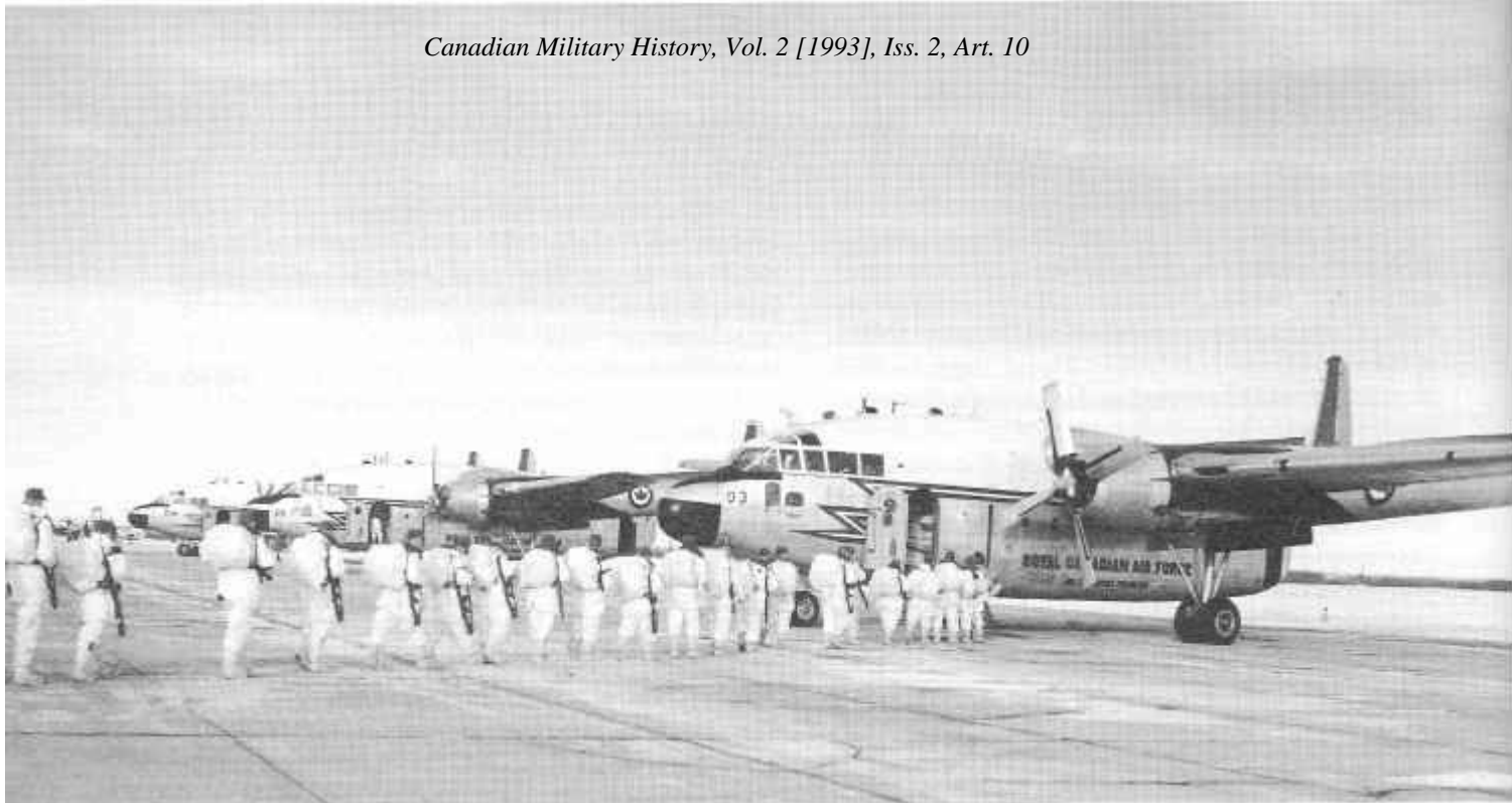
Troops boarding a CI 19 Flying Boxcar.