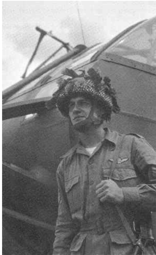
A Canadian soldier standing beside a CG-4A Glider during Exercise Eagle, 1949.

Between 1945 and 1947, the Canadian Army at its wartime strength was reduced from 494,258 all ranks to 15,563. In this reorganization, an Active Force that included three infantry battalions, two armoured regiments, one artillery regiment, an engineer squadron and various support units was