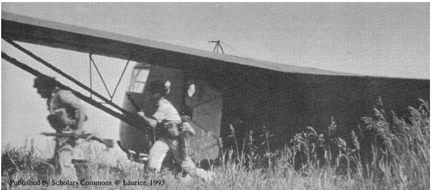
Troops exiting from a CG-4A Hadrian glider during Exercise Eagle. (CFPU ZK 1141-6)

Depending where the threat originated, the MSF unit could be mobilized at its home station and moved by air, highway or rail to the nearest MSF main base. Then, assault elements would be transported from the main base by non-tactical airlift to the advanced base and the operation could then be conducted. After performing the tactical air assault from the advanced base, MSF engineers would improve the airhead to allow follow up glider or other airlandings. Once sufficient forces were on the ground at the airhead, a ground attack would take place against the enemy lodgement while casualties were evacuated back to the main base. 52