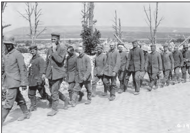
Top: Well turned out Canadian soldiers march to the front, June 1917.