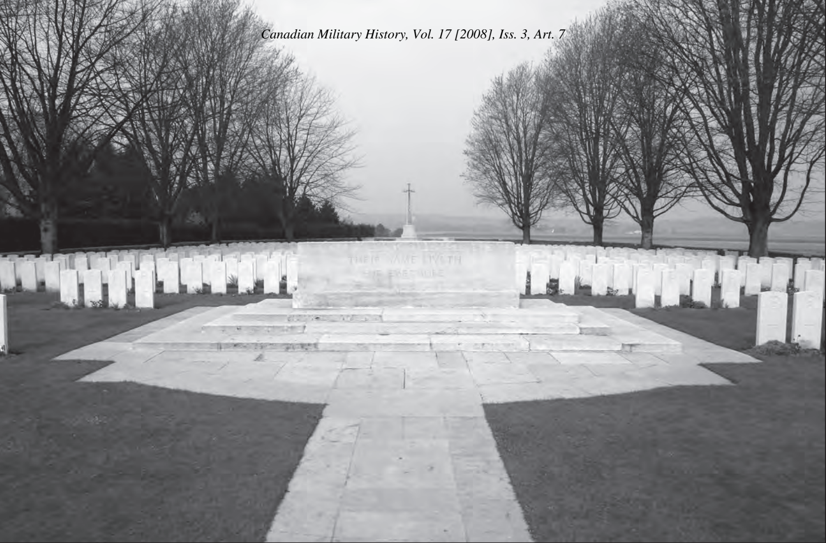
La Chaudière Military Cemetery, south of Avion, France.

and, sometimes, contradictory nature of surviving documentation from 1917, the partial hints provided by the physical remains, and the immense changes to the battleground over the last 90 years (including the appearance of a large coal slag heap in the midst of the June 1917 battlefield) made a battlefield reconstruction of the circumstances extremely difficult. Nonetheless, it appears that the two Canadians may have been some distance ahead of the raid's final objective, the German third trench line, which appears to still partially exist south of where the remains were found. Did they rush forward, pumped with adrenaline, chasing the enemy? Did they get lost in the night and find themselves ahead of the rest of the battalion? Did the Germans remove and bury their remains the day after the raid (when German medical personnel were seen working through the area)? 32