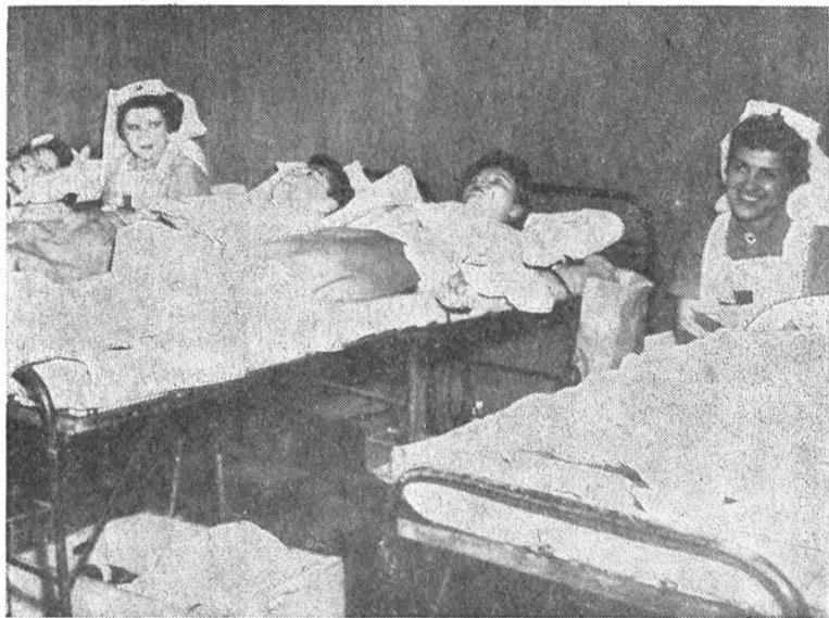
Three of the 213 Waterlooans who gave blood last Wednesday. Due to the limited time during which the collection team could remain at Waterloo the College was prevented from entering the national Corpuscle Cup competition.

On Sunday, Feb. 22 around five hundred unemployed men in Toronto were given copies of the Labor Party's Canadian Tribune. It is not necessary to relate how I came into the possession of one of these, But I would like to criticize one comment in a letter which accompanied the paper. It was stated that "there should not be one Canadian without a job in a rich country like ours." I think I can say with absolute certainty, that as long as this country remains free, there will be unemployment.